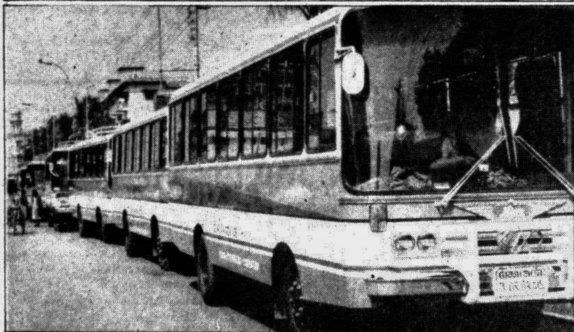
Kamalapur Railway Station (top) and coaches of Chittagong route at Fakirerpool Road (bottom) in city yesterday during 48-hour rail-road barricade programme of the jute and textile employees.

The second day of the two-day road and rail barricade programme by the jute and textile workers was observed partially Tuesday with reports of violence from Khulna. Road and rail communications remained disrupted with the Port City of Chittagong as several thousand workers barricaded the roads and rail-tracks near Barabkundu, our Staff Correspondent from Chittagong reports. Parliament will discuss the 'road and rail barricade' issue today (Wednesday). Speaker Shaikh Razzak Ali set the time for discussion under Rule 68 following a number of adjournment motions moved by opposition members to discuss the barricade situation and its aftermath. The Jute and Textile Workers Action Committee that called the barricade for their respective eight and six point demands, claimed that three workers were killed when police and BDR men open fire at the barricading workers near the Natunrastra Square Tuesday morning. The Khulna unit of action committee has called a full-day hartal in Khulna today (Wednesday). Khulna's Khalishpur thana sources when contacted over telephone rejected the claim of the Action Committee saying 'none was killed but several dozen including five police men were injured.' The officer on duty said that 56 people were arrested from the scene near the rail gate and BIDC road and charged under anti-terrorism laws. See Page 12 Col 8