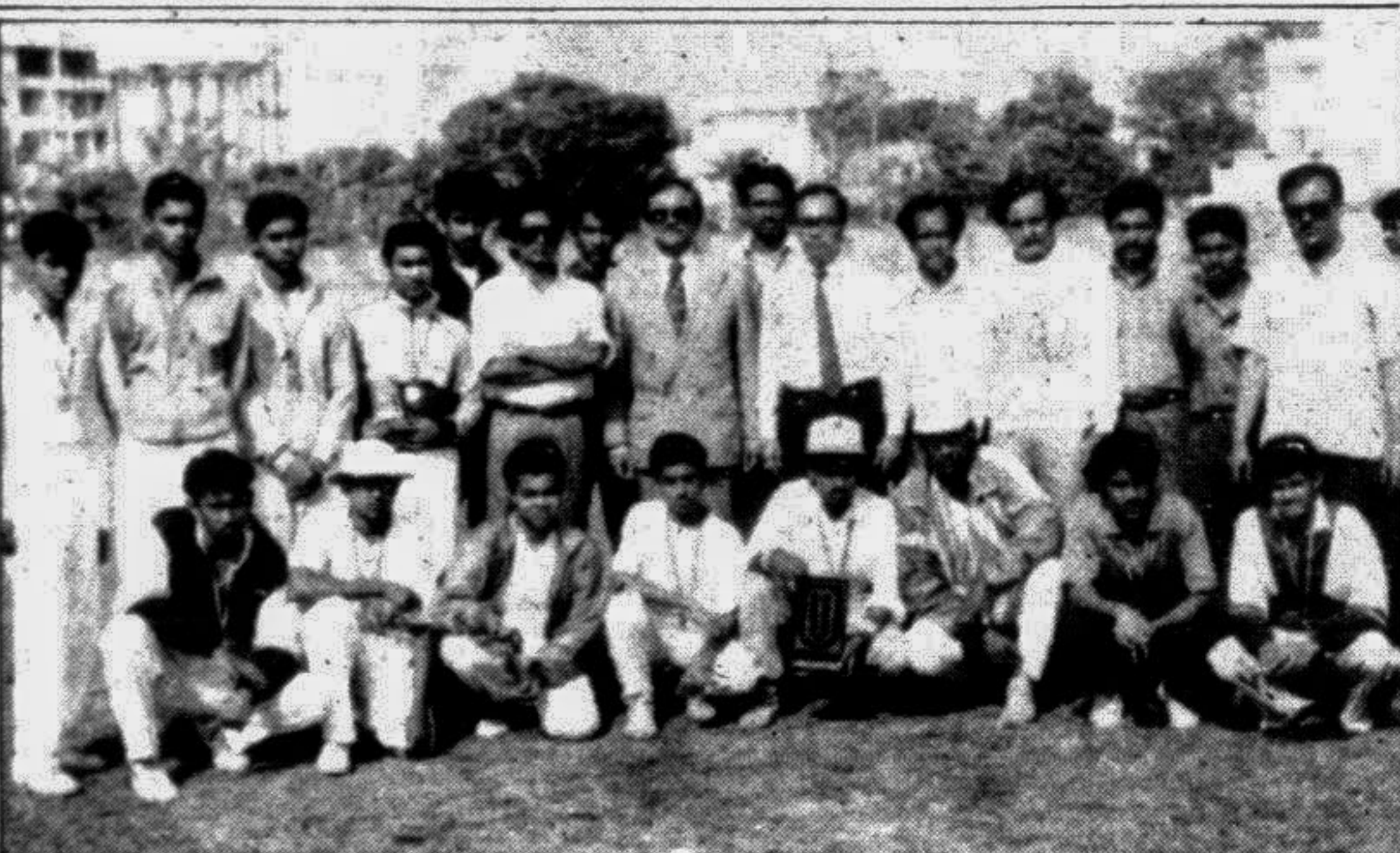
Victorious Willes Little Flower High School which regained the Nirman Schools cricket championship for the Dhaka zone outplaying Saint Joseph's High School by eight wickets at the Dhanmondi Cricket Stadium yesterday.