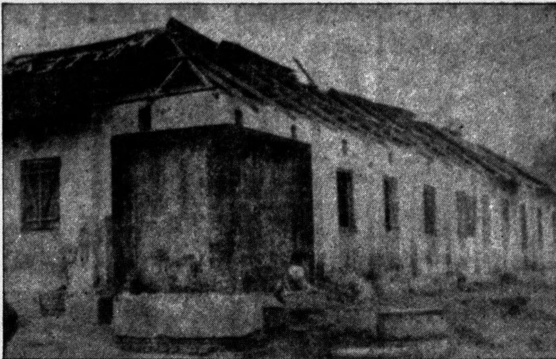
RANGPUR: Local Jummapara Government Primary School has not yet been repaired which was damaged by a cyclonic storm recently.

Mymensingh Sadar Thana Parishad organised a discussion meeting at the premises of thana parishad.