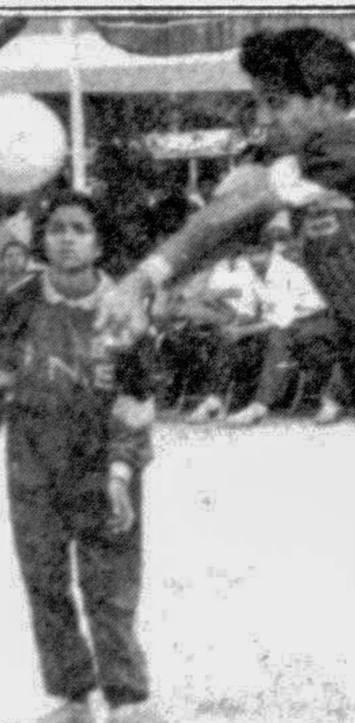
Action from the Dhaka Metropolis girls' schools volleyball championship tie between Viquarunnessa Noon School and South Breeze at the Outer Stadium yesterday. Viquarunnessa won the match 9-15, 15-3, 15-2 and 15-10.

impressively by winning the Qatar Open in Doha and who announced his intention to reclaim the top ranking, favouritely. "A final is a final, no matter who you play. Sergi proved a better player than seeds this week. I'll take him very seriously," Becker said. In the earlier semifinal, Bruguera rallied from being routed in the second set and 3-0 deficit in the third to upset third-seeded Czech Petr Korda 6-4, 0-6, 7-5. The unseeded Spaniard, ranked 17th, needed an hour and 51 minutes — and some luck — to reach his first Tour event final of the season. He reached the quarterfinals in Marseille last week. Korda, ranked sixth, appeared well on his way to winning after rebounding from his first-set loss to rout Bruguera in the second set and broke his opponent to lead 3-0 in the third. Bruguera, who slightly injured his knee slipping on the carpet in the opening game of the second set, tied the set at 4-4, broke Korda in the 11th game to lead 6-5 and held serve to win. The final points came when Korda, bothered by two dubious calls, netted an easy smash and hit two forehands out.