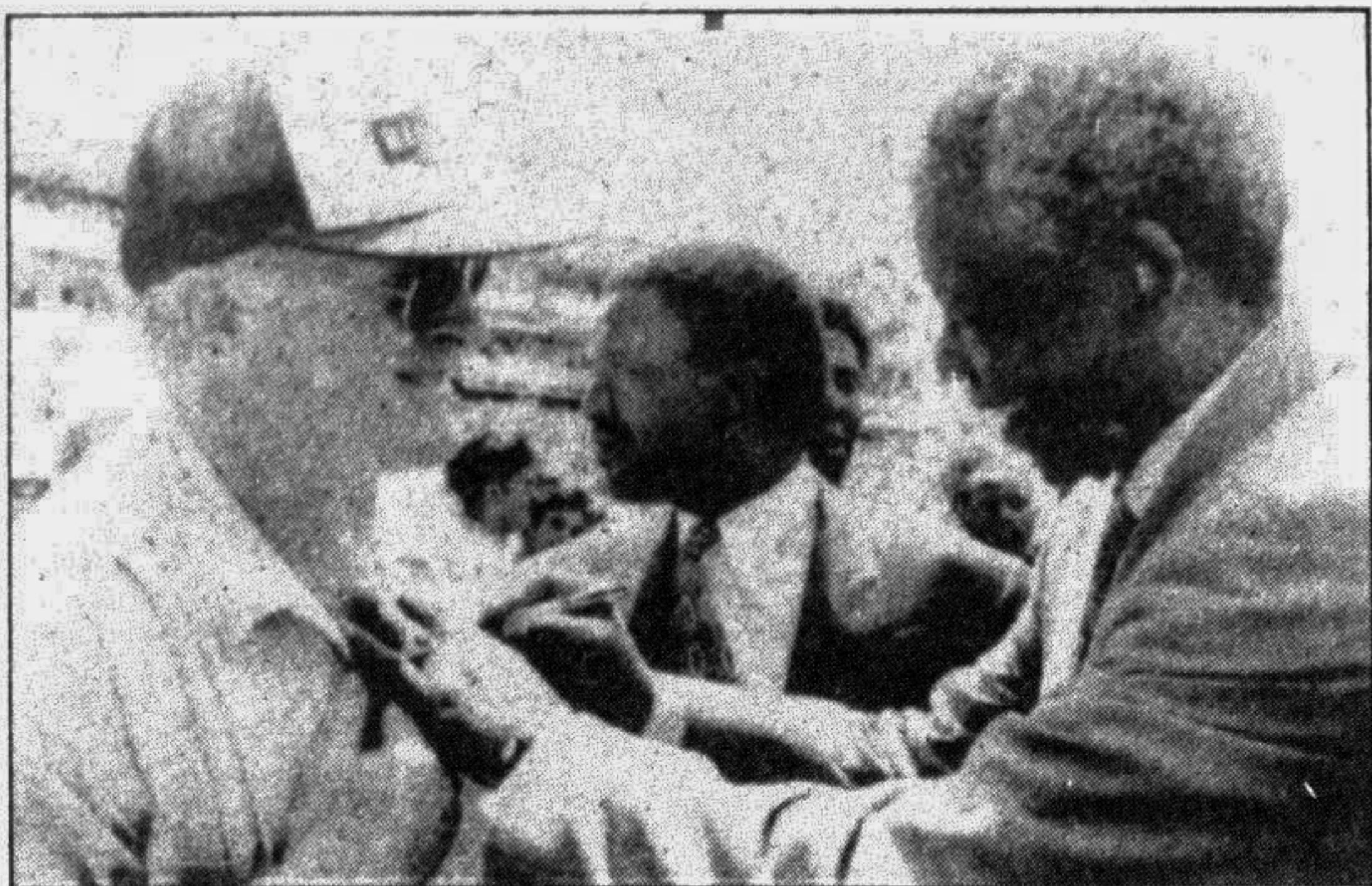
A cricket fan asks African National Congress (ANC) President Nelson Mandela for an autograph on his shirt at a one-day international match between Pakistan and the West Indies in Johannesburg on Feb 13.

Sports Reporter The Bangladesh Women's Sports Federation will start a coaching programme for swimmers ranging from young girls to older women at the Dhanmondi Women's Complex on February 23, says a press release. Interested trainees have been requested to contact the federation office.