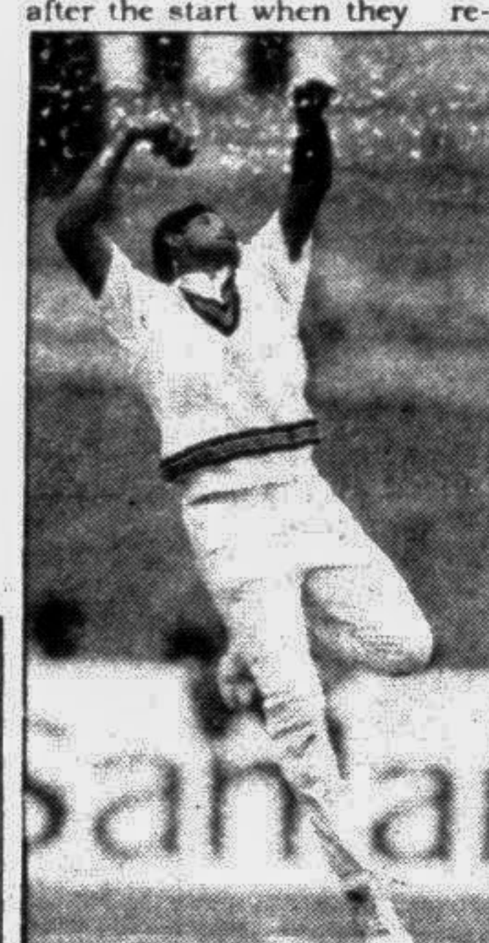
A KUMBLE... 5 for 51

Chris Lewis... 108 no Fall of wickets: 1/46; 2/157; 3/166; 4/175; 5/179; 6/179; 7/220; 8/277; 9/279 Bowling: O M R W Prabhakar 3 2 7 0 Kumble 25 9 61 2 Chauhan 39.3 16 69 3 Raju 54 2 1103 4 Kapil Dev 4 0 11 0 Tendulkar 2 1 5 0 ENGLAND: Second Innings Smith c Amr b Kumble 56 Stewart lbw Kapil Dev 0 Hick c Tendulkar 0 b Kapil Dev 0 Gatting lbw Raju 19 Fairbrother c Prabhakar b Kumble 9 Blakey b Kumble 6 Salisbury b Kumble 12 Lewis batting 108 Jarvis c Tendulkar b Kumble 2 Tufnell batting 10 Extras: (4b, 5lb) 9 Total: (for eight wickets) 231 Fall of wickets: 1/10; 2/12; 3/71; 4/82; 5/88; 6/99; 7/171; 8/186 Bowling: O M R W Kapil Dev 11 5 36 2 Raju 23 3 76 1 Chauhan 16 2 51 0 Kumble 16 5 51 5 Prabhakar 3 2 4 0 Tendulkar 2 1 4 0