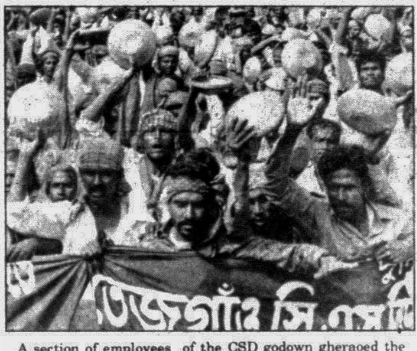
A section of employees of the CSD gheraoed the 'Khaddya Bhaban' yesterday demanding payment of their fifteen month's arrear salaries.