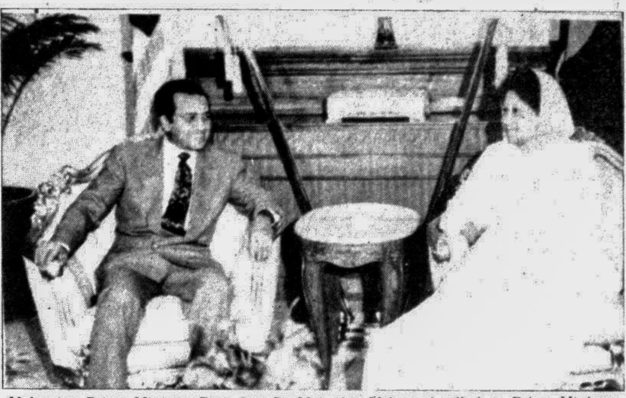
Malaysian Prime Minister Dato Seri Dr Mahathir Mohamad called on Prime Minister Begum Khaleda Zia at her Secretariat yesterday.

The money is to finance ongoing programmes and projects, including those under the Disaster Preparedness Programmes of BDRCS.