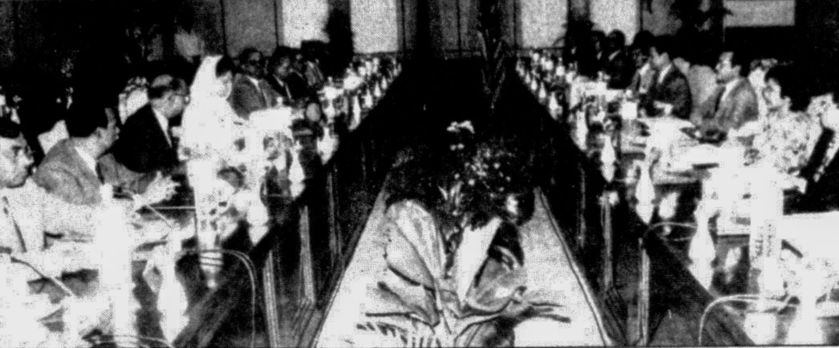
Malaysia and Bangladesh held formal talks at the International Conference Centre Saturday. Prime Minister Begum Khaleda Zia and Dr Mahathir Bin Mohamad led their respective countries.