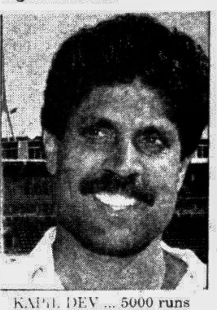
KAPIL DEV ... 5000 runs