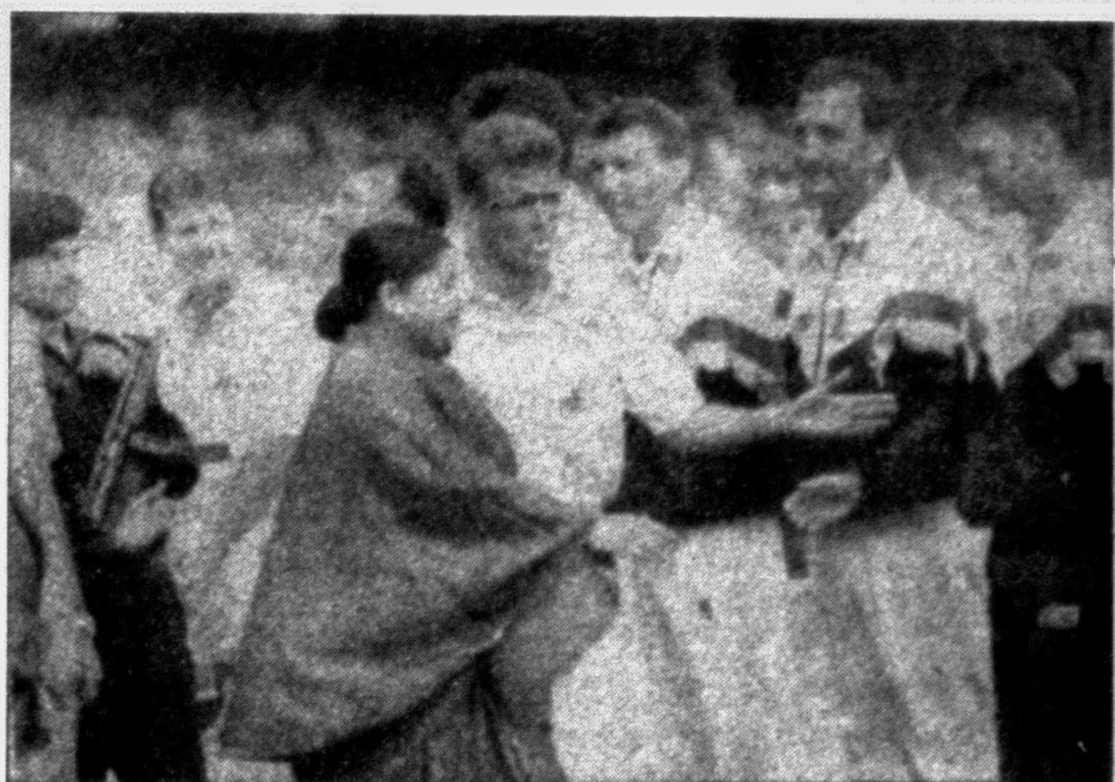
England's stand-in captain Alec Stewart (C) introduces his teammates to Tamil Nadu Chief Minister Jayalalitha Jayaram (Centre L) before the start of the opening day of the second Test against India in Madras on Feb 11.