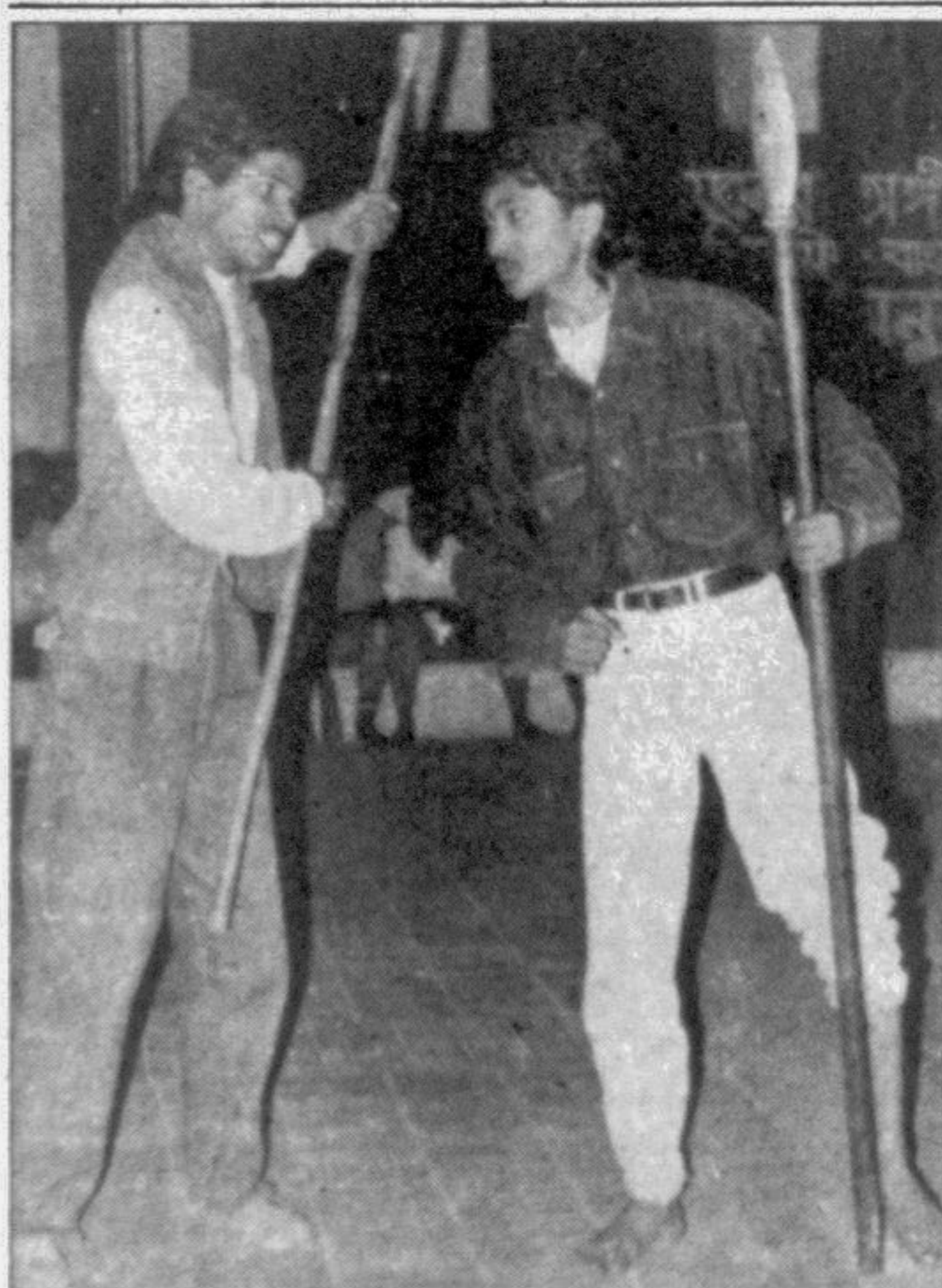
Mohna Natsya Gosthi staged 'Aadap' yesterday in city as part of its Ekushey programmes.