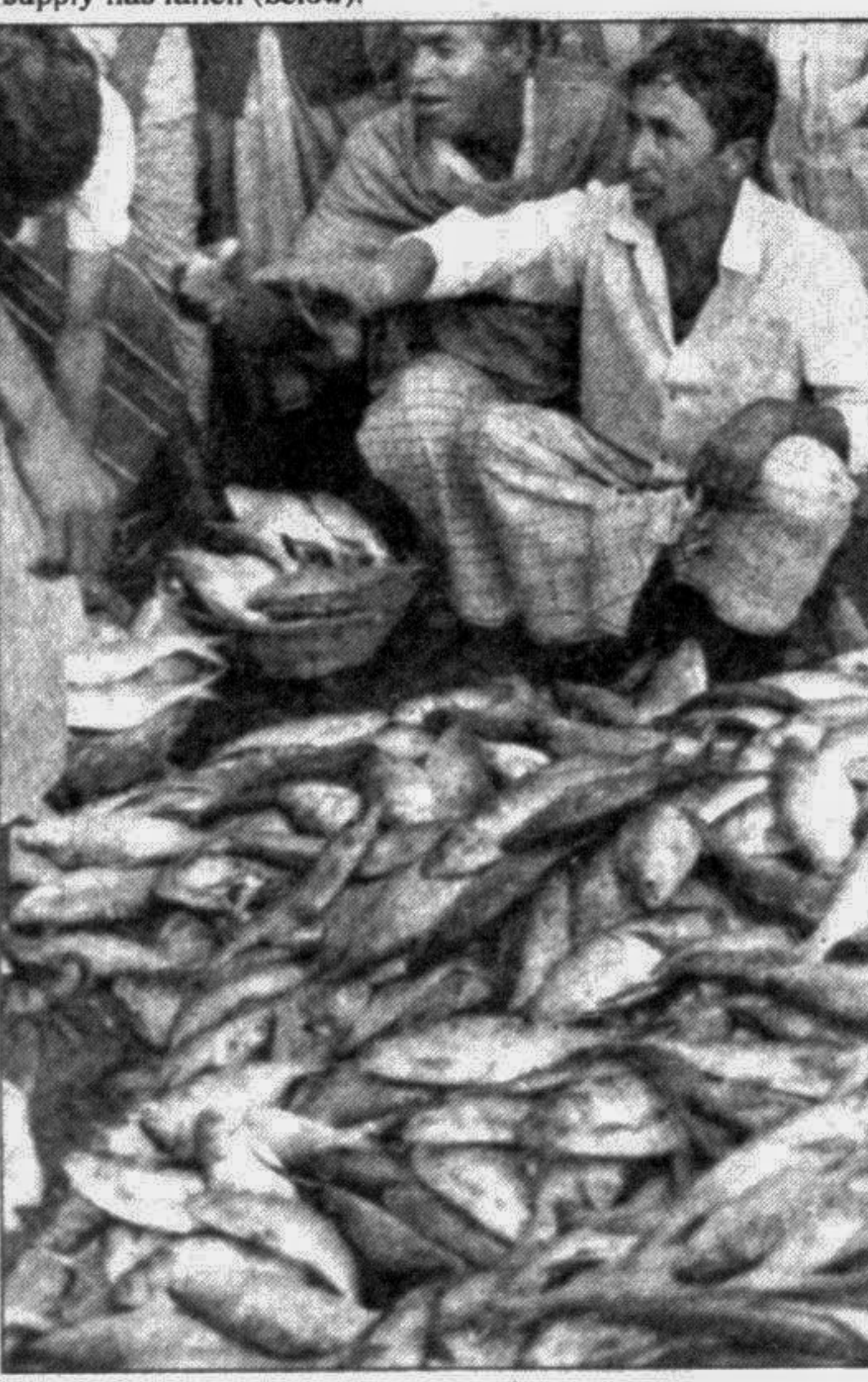
Fish rot as ice factory strike on