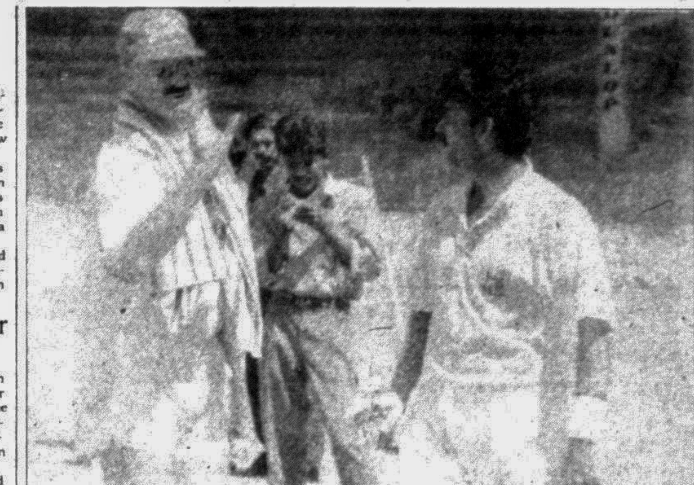
Former Australian fast bowler Dennis Lillee gives tips to India's all-rounder Manoj Prabhakar (R) on the eve of the second Test against England at the Chepauk, Madras yesterday. Dennis Lillee is in the city to oversee his Madras-based Pace Academy.

Top-seed Jim Courier, ranked No 1, was scheduled to play Wednesday, as were second-seed Michael Chang and defending champion MaliVai Washington, the No 4 seed.