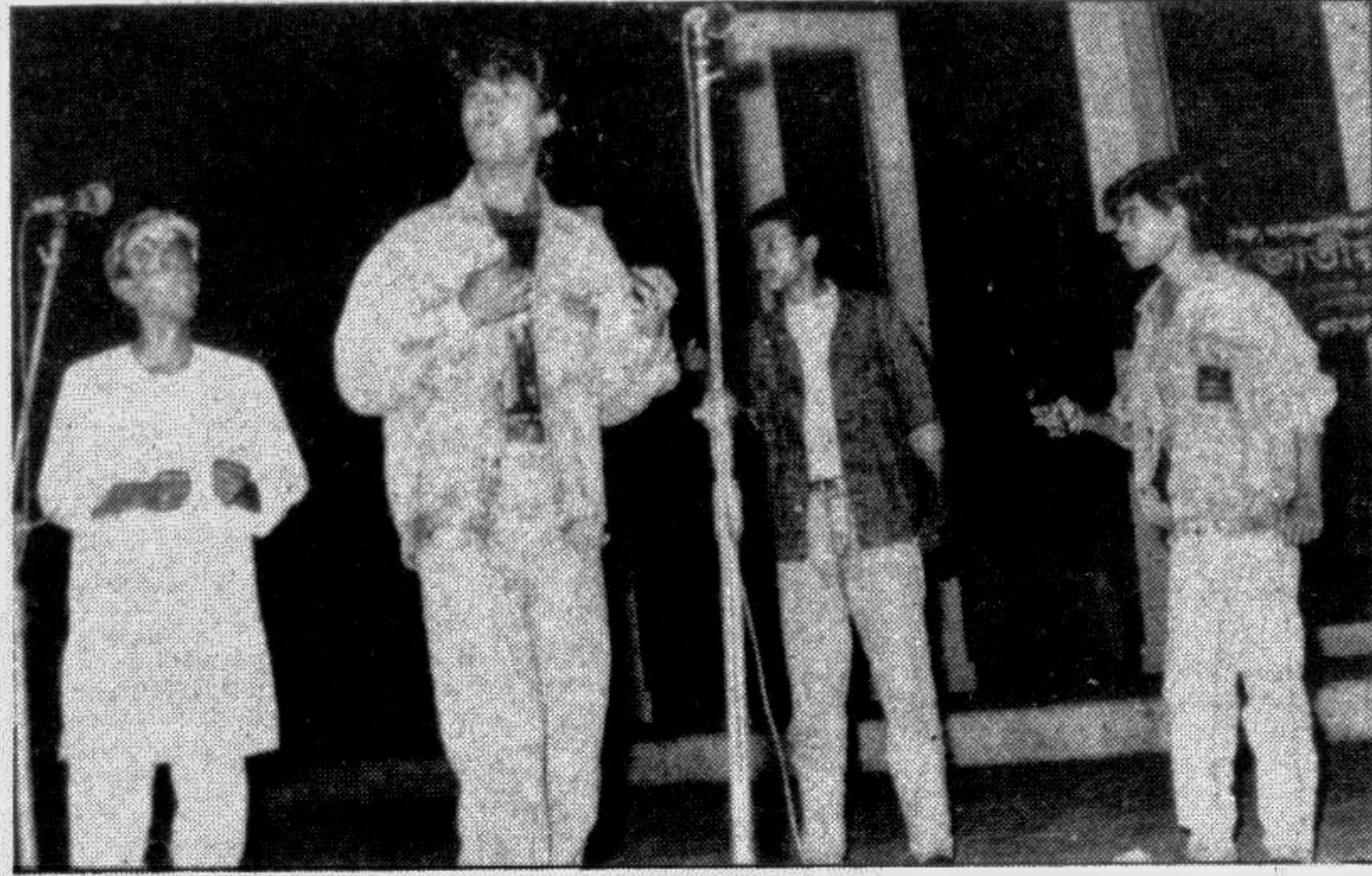
A scene from the play from Faridpur, staged at Shahid Minar recently.

Sitting on the steps of the Shahid Minar, enjoying the street theatre that the young actors from the 'mufassil' area had to present, one felt that democracy did indeed prevail in the country. This is going by the fact that the play from Faridpur, 'Shankarika Chakra Eboni Ithash' which one had witnessed, was meant to be slings and arrows directed at some important personage in the country. Such a play would surely not have been allowed to be presented, as an Ekushey festivity, two decades back, a decade ago, or even two years ago.