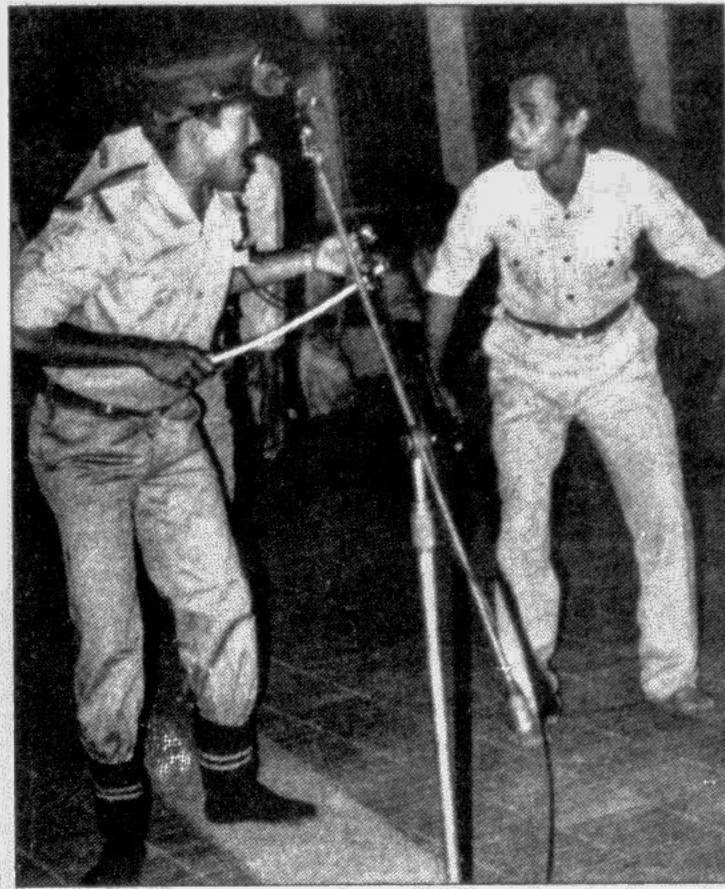
Drishtipat Natya Sangsad staged 'Ghatak' at the Central Shaheed Minar yesterday.

Speakers at the reception paid their respect to the veteran teacher and called for imbibing his ideals for a better society.