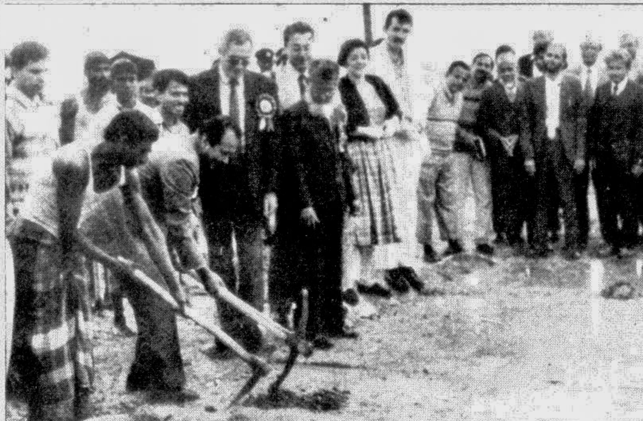
BOGRA: Archaeology Department of Bangladesh and France jointly inaugurating the excavation work at Mahasthan Garh on February 1.

Feb 8 : Bangladesh Savings Bureau, Tangail district, has achieved savings worth Taka 4.5 crore during the first half of the current financial year, reports BSS. Of the amount Taka 1.5 crore was achieved through bureau office through post offices and banks. An official source said that savings department had issued an eight years investment bond from this year in addition to their existing savings bond certificates and postal savings accounts.