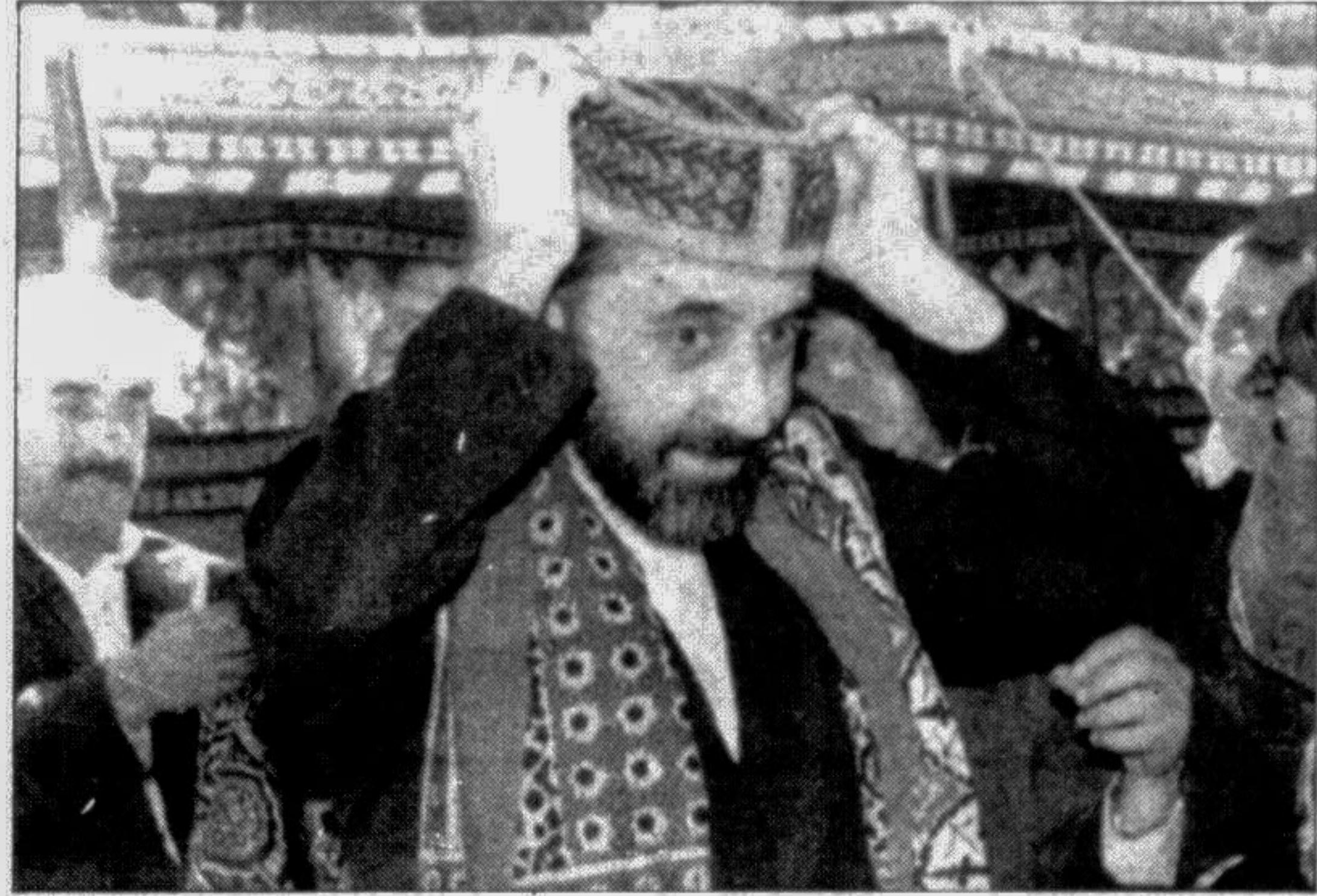
SIBI (Pakistan): Iranian Foreign Minister, Ali Akbar Velayati tries on a traditional Balouchi cap and an ajrak (scarf) presented by Quetta Senator Fasih Iqbal February 7. On the second day of Economic Cooperation Organisation (ECO) ministerial session being held in Quetta. Delegates visited Sibi 165 km east of Quetta for the Sibi festival of horse and cattle.

The conference also decided to establish a direct air link between the capitals of each of the ECO countries and discussed the possibility of starting an ECO airline.