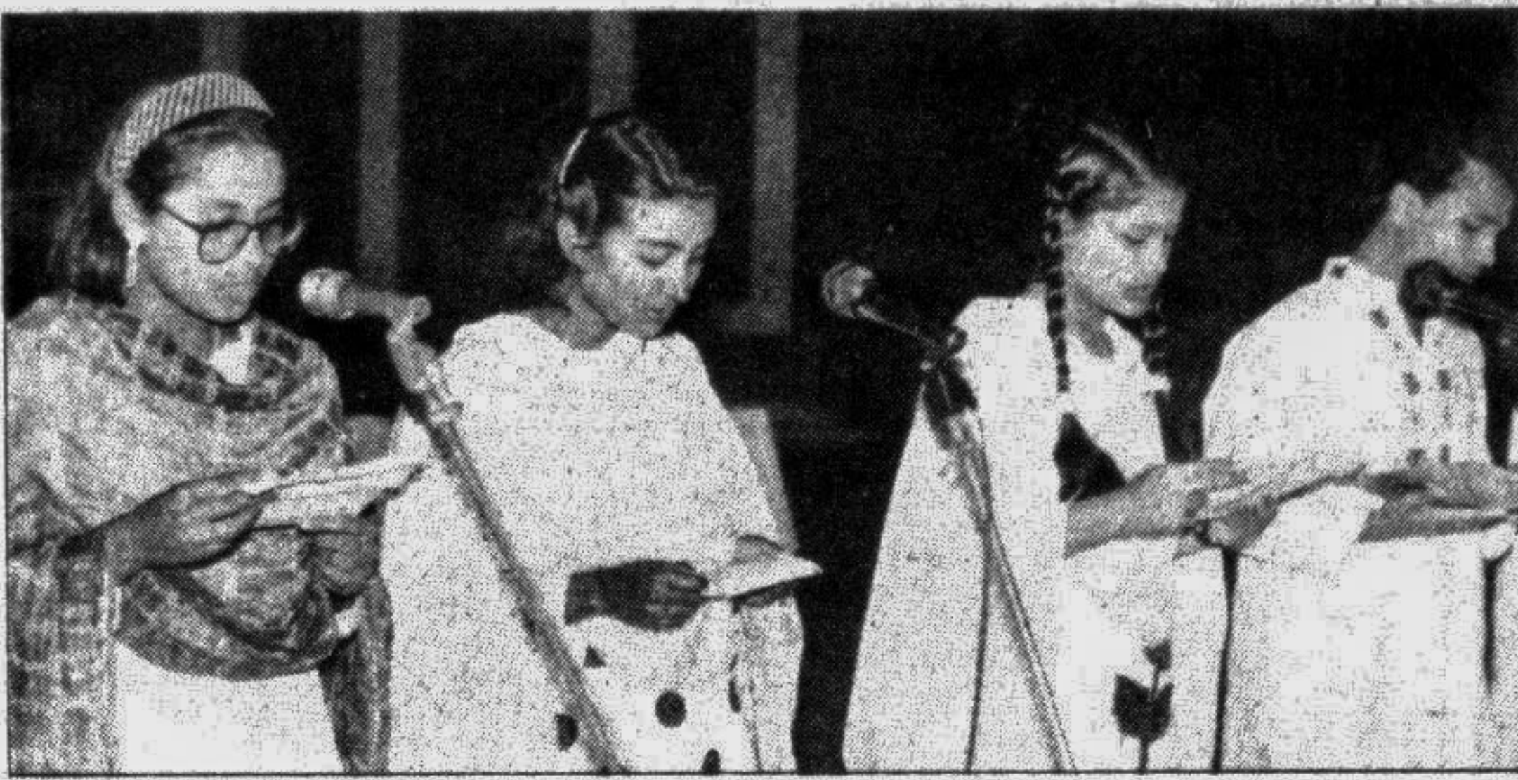
Sammilito Sangskritik Jote organised a poetry recitation programme at Shaheed Minar in the city yesterday.