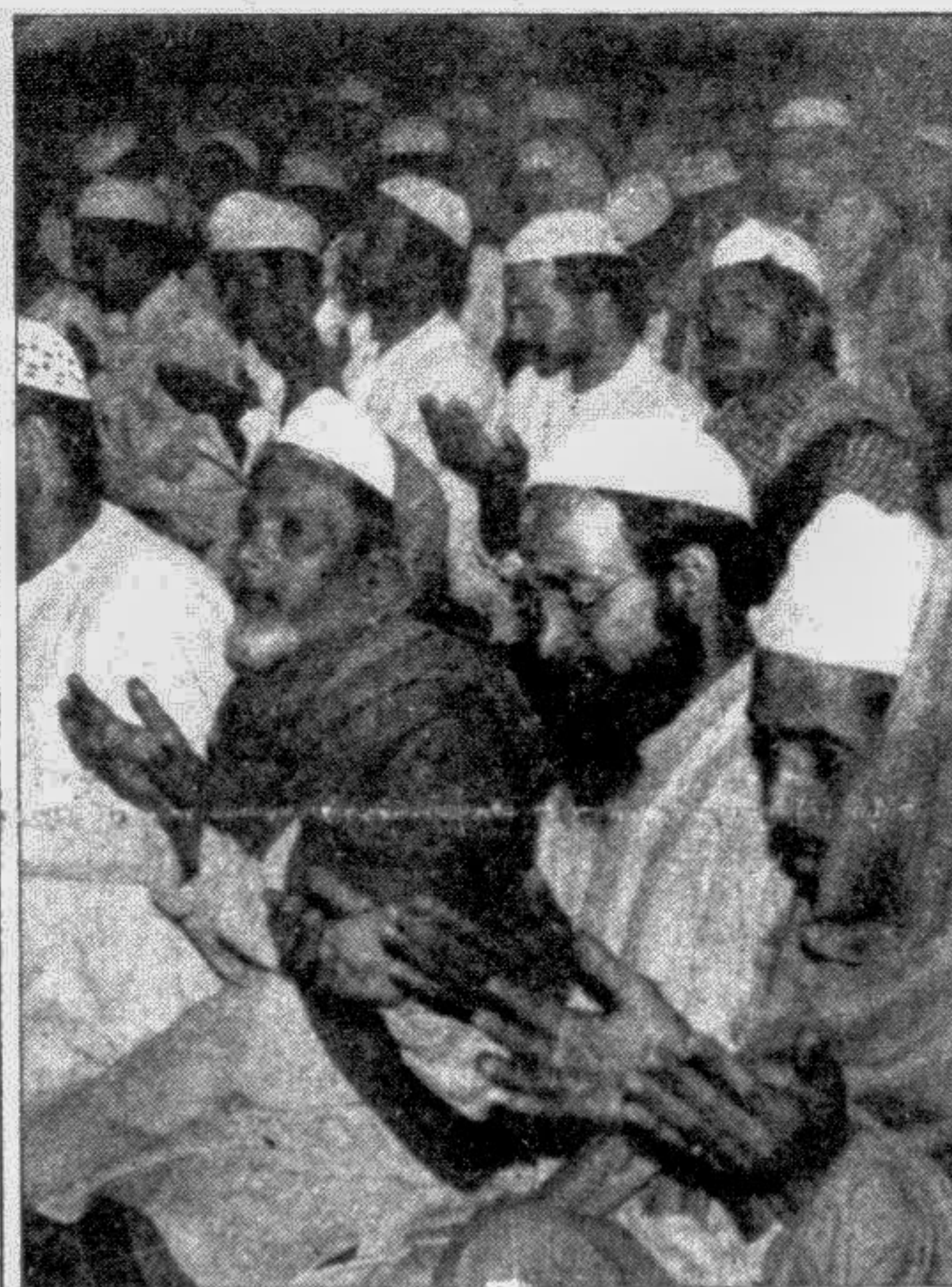
Devotees offering munajat at a city mosque on the holy night of Shab-e-Barat. (Story on Page 12)

Noting that the Chief Election Commissioner, politicians, diplomats and journalists had all termed the by-election free, fair and peaceful, the BNP Secretary General said: "There is no confusion as far as the See Page 12 Col 7