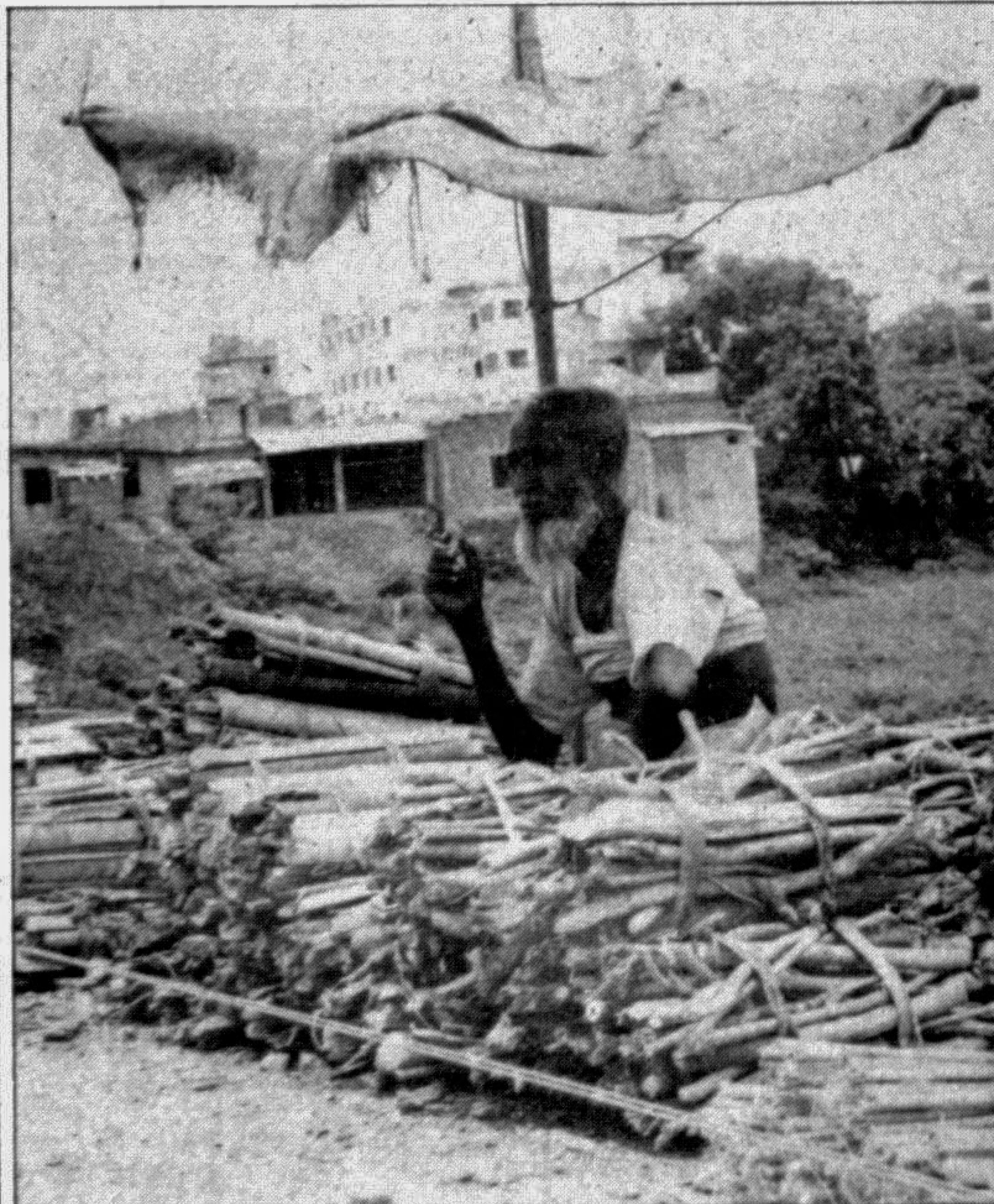
BOGRA: This oldman is waiting for firewood customers. The poor people in rural areas are compelled to cut and sell even small trees for mere survival.

About 100 officers and workers have become unemployed in 1979 due to closure of BRTM, situated in Aziznagar, the industrial estate of the district. The legitimate benefits of services including the salaries and allowances of the officers and workers are still outstanding, who were fallen victims of unemployment, the victims alleged.