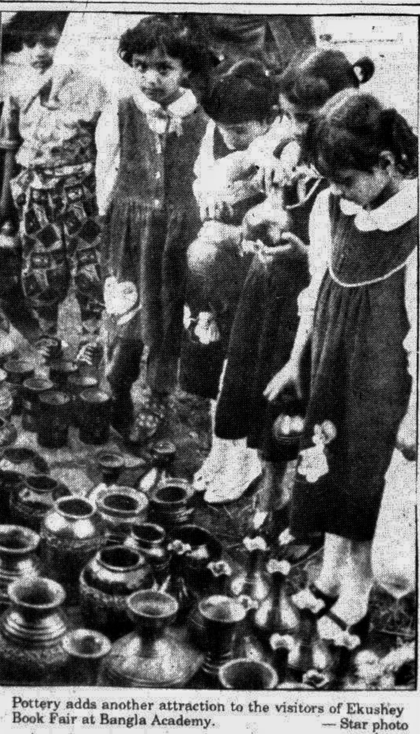
Pottery adds another attraction to the visitors of Ekushey Book Fair at Bangla Academy.