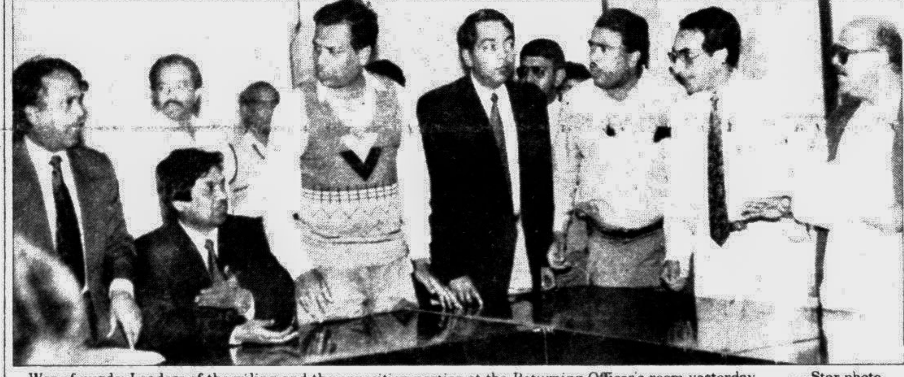
War of words: Leaders of the ruling and the opposition parties at the Returning Officer's room yesterday.

ISLAMABAD, Feb 4: Pakistan's National Assembly pledged continued support to the Kashmiri "self-determination" struggle, in a resolution adopted unanimously here today, reports AFP. The resolution, moved by Parliamentary Affairs Minister Amir Hussain, condemned what it called Indian "brutalities" on Kashmiris appealing to the civilized world to side with the "oppressed" people. An influential fundamentalist party, the Jamaat-e-Islami, has called for the observance of a nationwide day of solidarity Friday with the three-year old Muslim revolt in Indian-controlled Kashmir. More than 9,000 people have died during the ongoing insurgency blamed by India on Pakistan, which says it only extends moral support to a "legitimate" struggle for "self-determination."