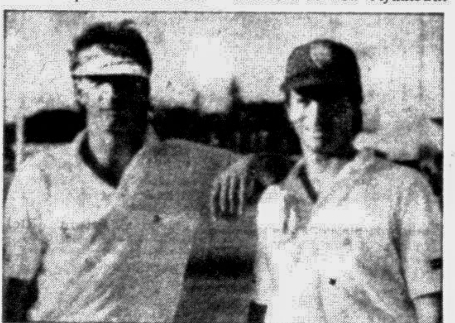
THE WAUGH TWINS... made it

His side will have warmup matches in New Plymouth