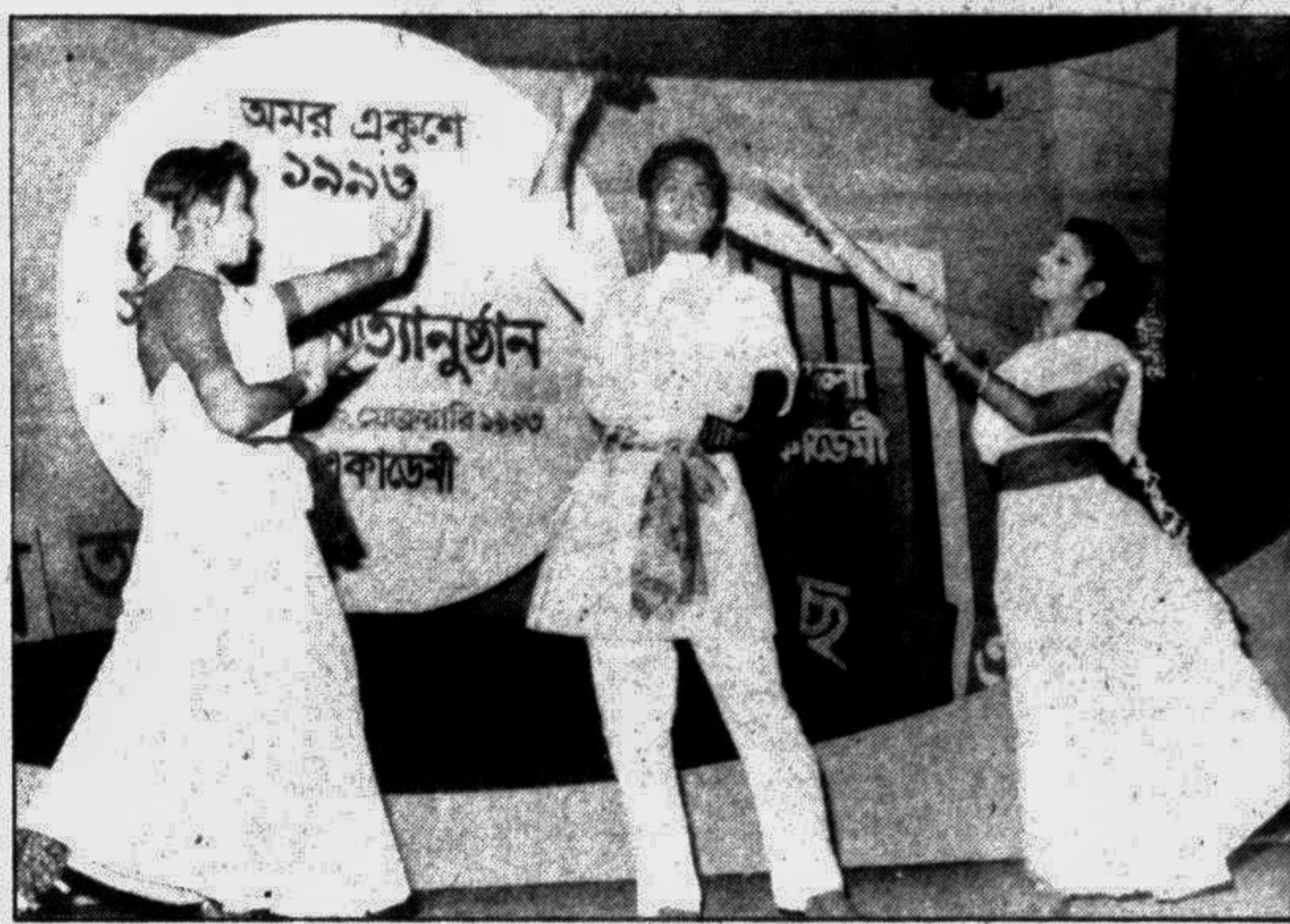
Dhaka University students staged a dance drama as part of the Ekushey programmes in the Bangla Academy premises on yesterday.