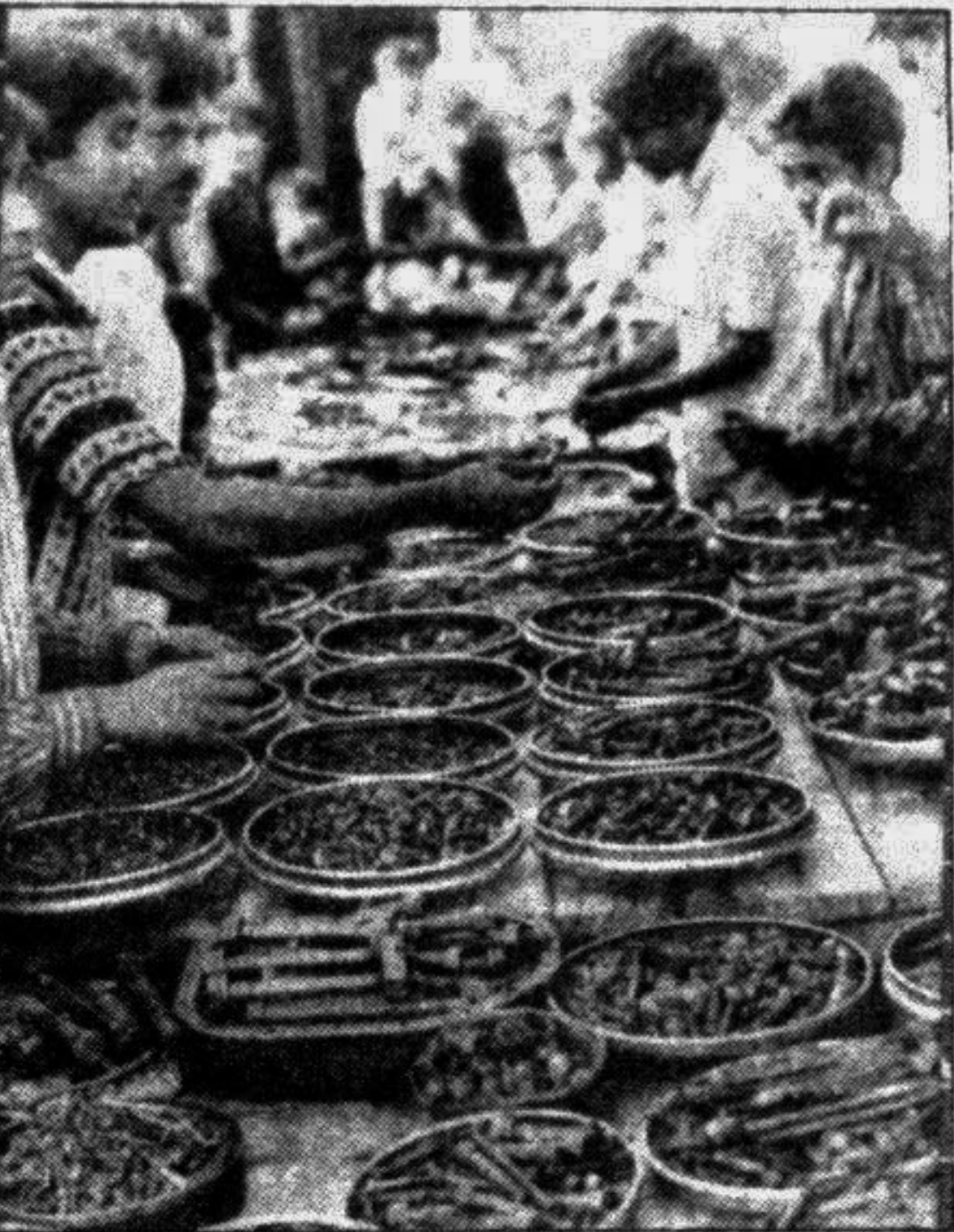
Vendors selling nuts and bolts in the city's junk junction at Dholakhal.

The spoons are my customers' hot favourite, he reveals. I sell those for Tk 2 to Tk 4 depending on their sizes and designs. His buyers are mostly down and out people. Shum dwellers