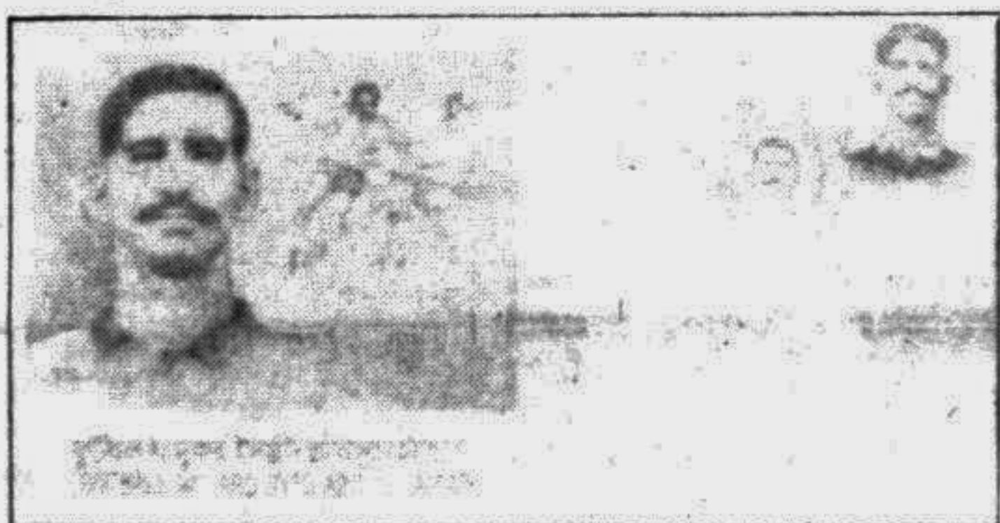
First day cover on Football Wizard.