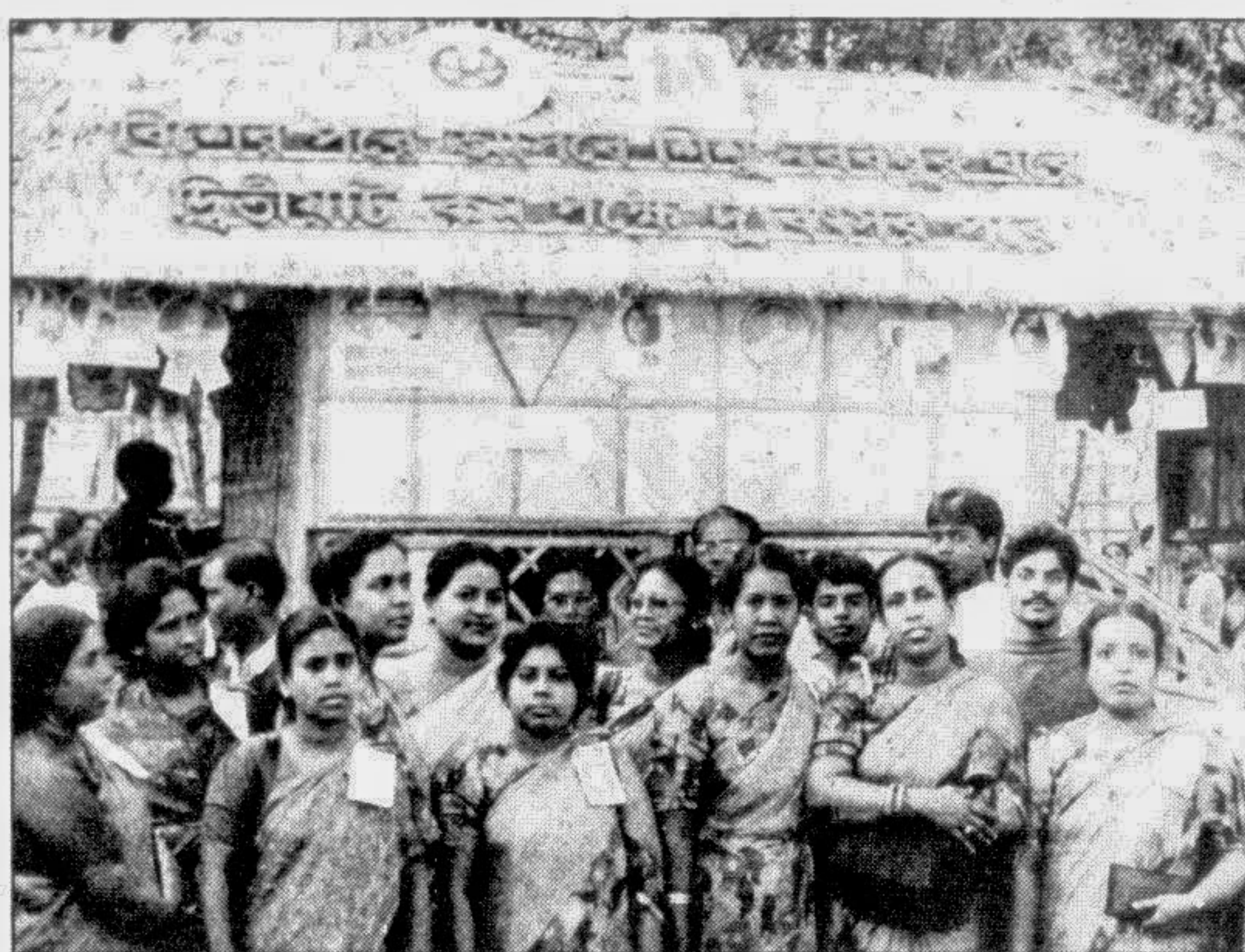
A rally organised in observance of National Population Day in the city yesterday.