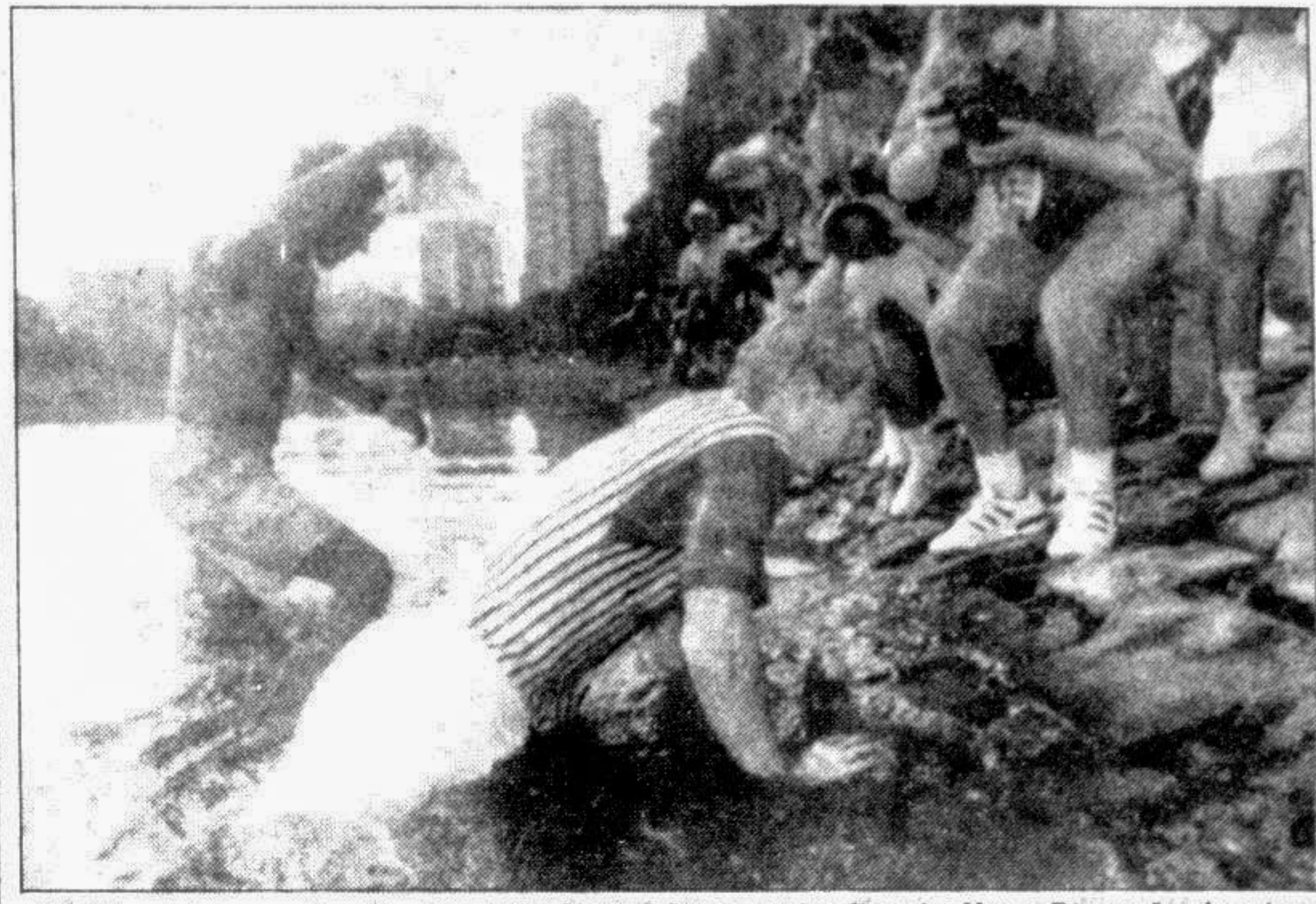
World number one Jim Courier of the United States cools off in the Yarra River after beating Sweden's Stefan Edberg at the Australian Open final in Melbourne on Jan 31.

All concerned have been asked to be present at the Dhaka Stadium on February 5 at 7:15 pm.