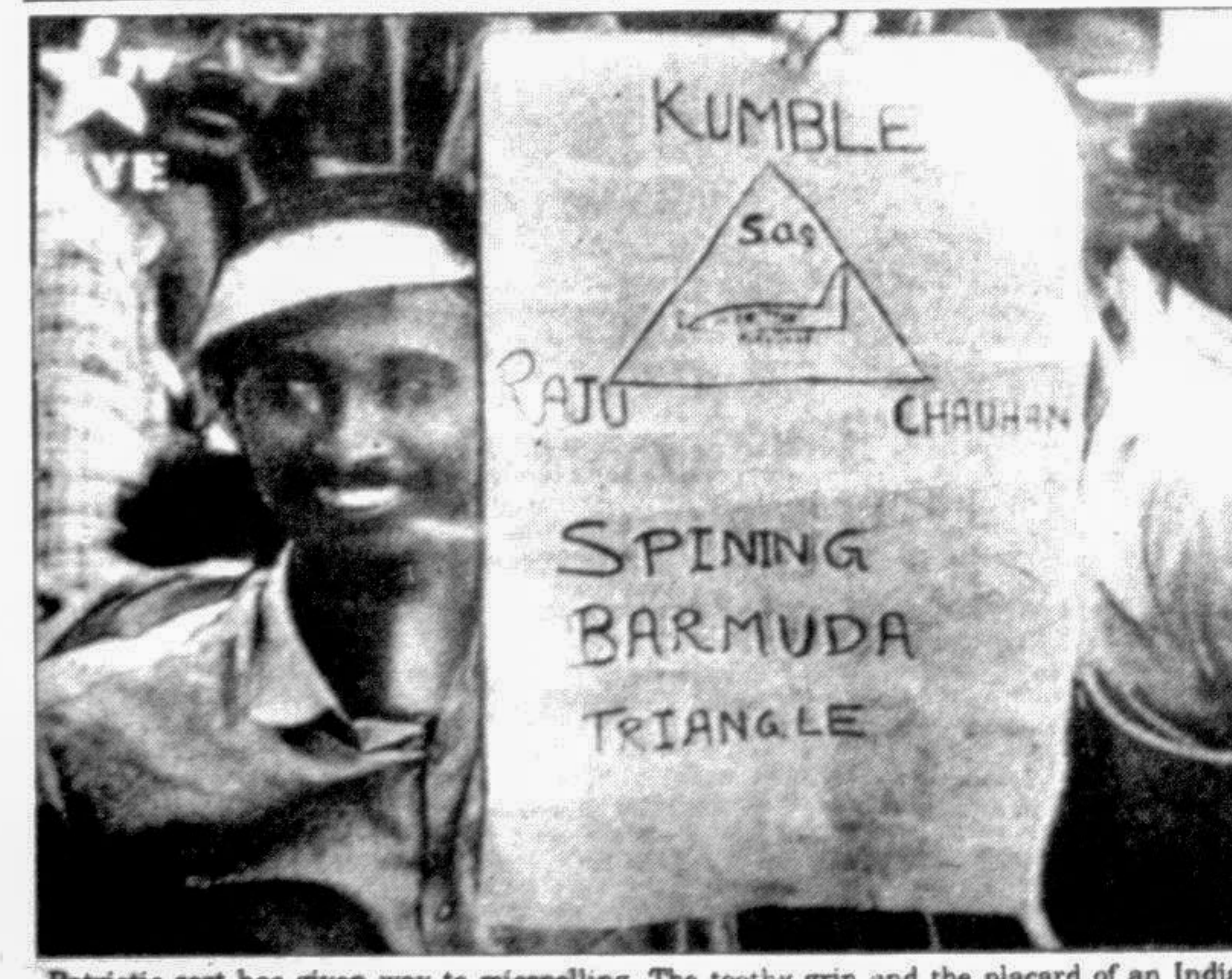
Patriotic zest has given way to misspelling. The toothy grin and the placard of an Indian supporter in the stands on the penultimate day of first Test between India and England say it all.

They trail 16 points behind leaders Norwich, who returned to the top on Saturday with a 1-0 win at Everton.