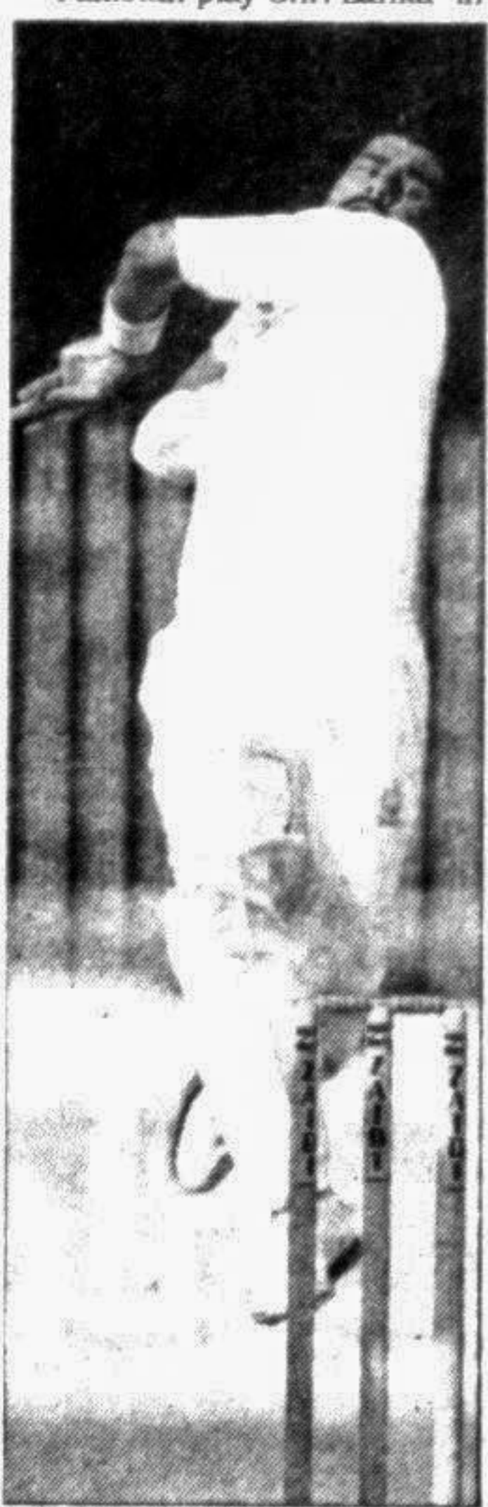
WAQAR... new mark the second game of the triangular competition on

Bowling: O M R W Wasim Akram 10 0 34 0 Aaqib Javed 7 1 11 0 Mohammed Arshad 6 0 43 0 Waqar Younis 10 3 26 2 Mushtaq Ahmed 10 0 42 1 Salim Malik 7 0 41 1