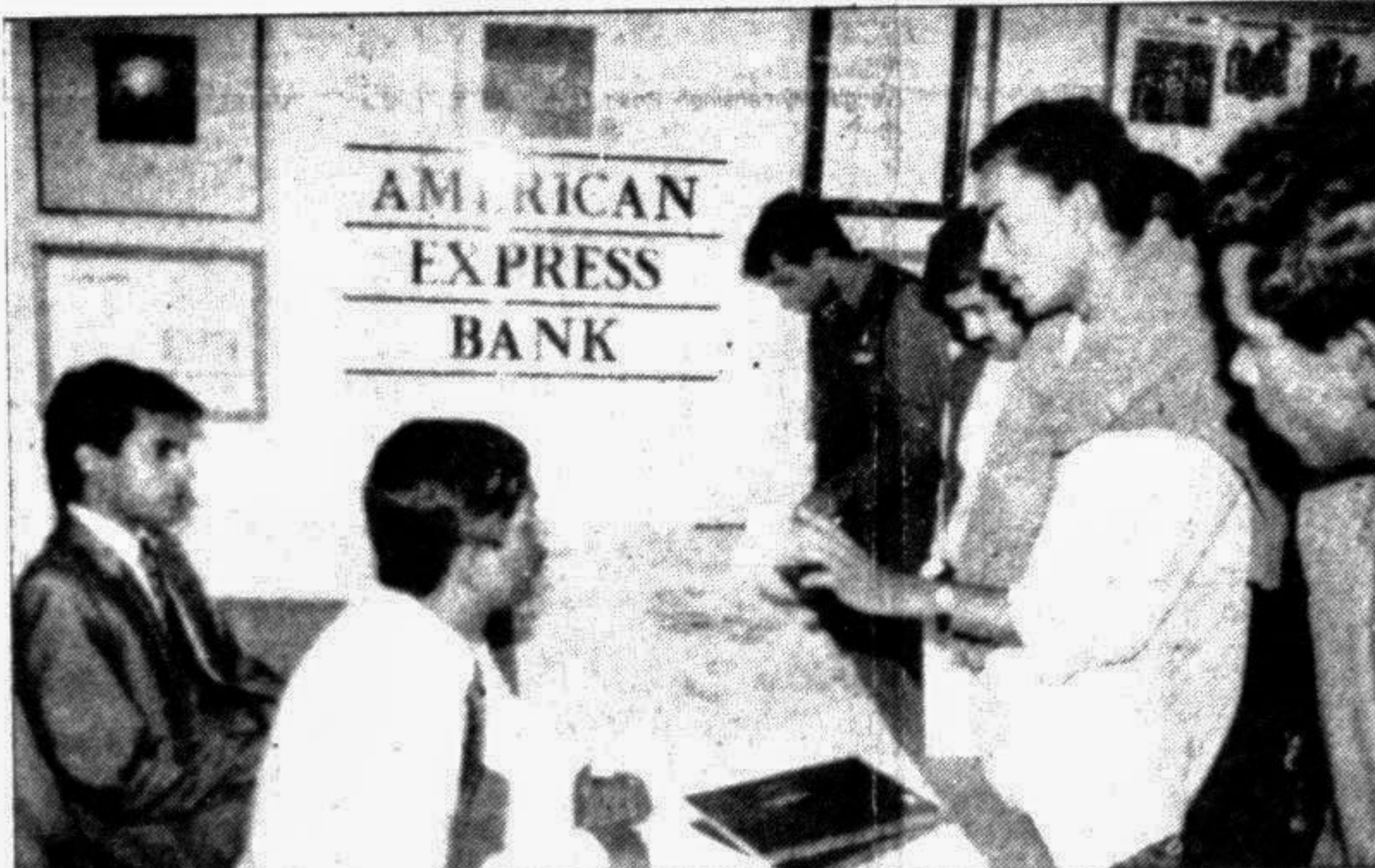
American Express Bank stall at the US Trade Show '93 at Sheraton Hotel.