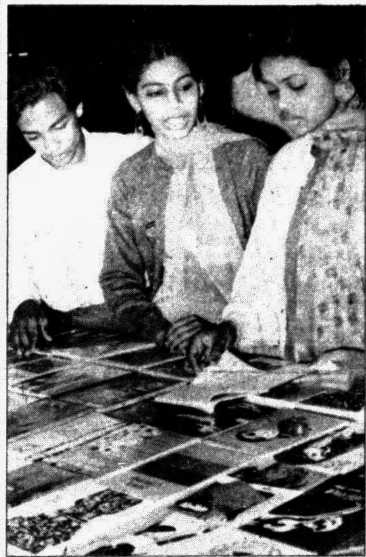
Visitors at a stall in Bangla Academy Ekushey Book Fair yesterday.

The Convenor of the Chittagong Hill Tract affairs in agreement with the other members of the committee See Page 12 Col 1