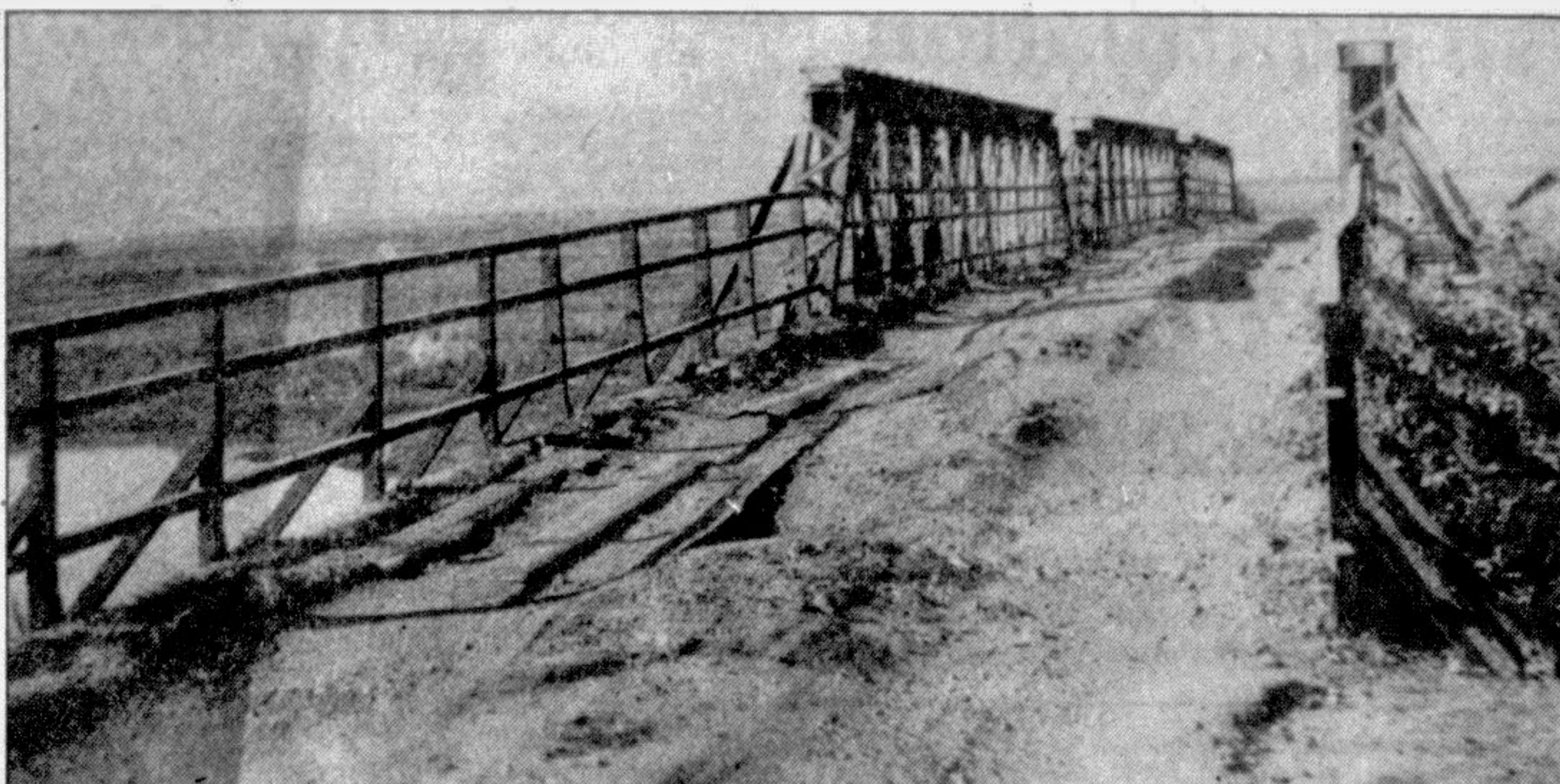
SYLHET: Dilapidated condition of a bridge on the Sylhet-Salutikor road which needs immediate reconstruction.