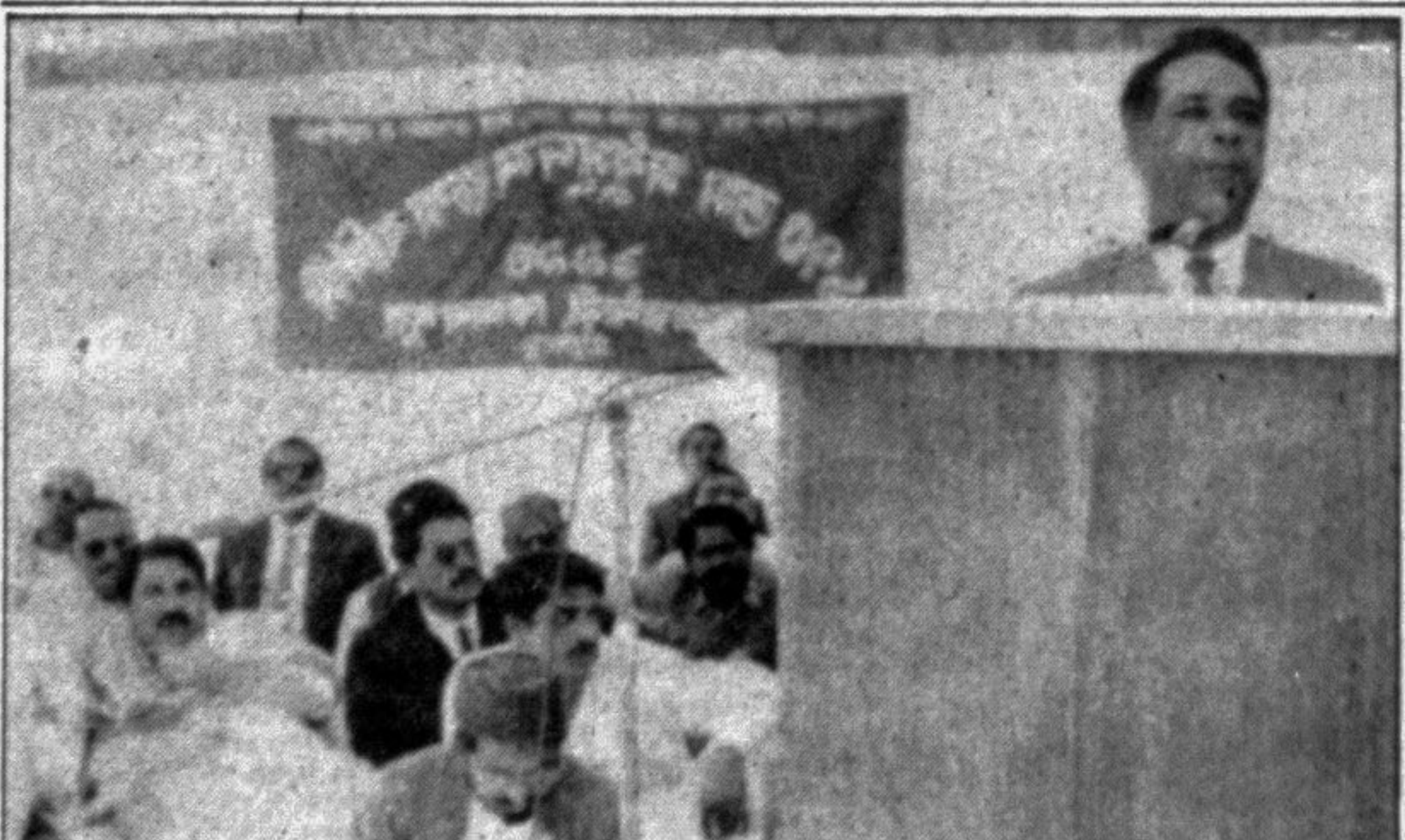
Jute Minister A S M Hannan Shah speaking at the inaugural function of Modhu Mela at Kasabpur of Jessore in observance of the 170th birth anniversary of poet Michael Modhusudan Dutta on January 25.

The ill equipped lone fire station of Manikganj cannot cope with the increasing number of fire incidents. Moreover, the fire men cannot reach the spot timely due to pitiable condition of kutcha road in the district.