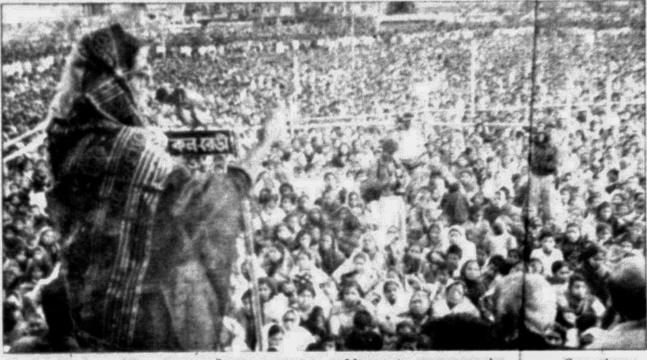
Sheikh Hasina addressing an election meeting at Mirpur in city yesterday.

By DMCH Correspondent Doctors, nurses and other staff of the Dhaka Medical College Hospital (DMCH) abstained from duties for four hours from 8 am to 12 noon yesterday in protest against storming of the hospital by armed men last Thursday. At a rally yesterday all the staff of DMCH decided to abstain from duties for three hours from 10 am to 1 pm today and tomorrow.