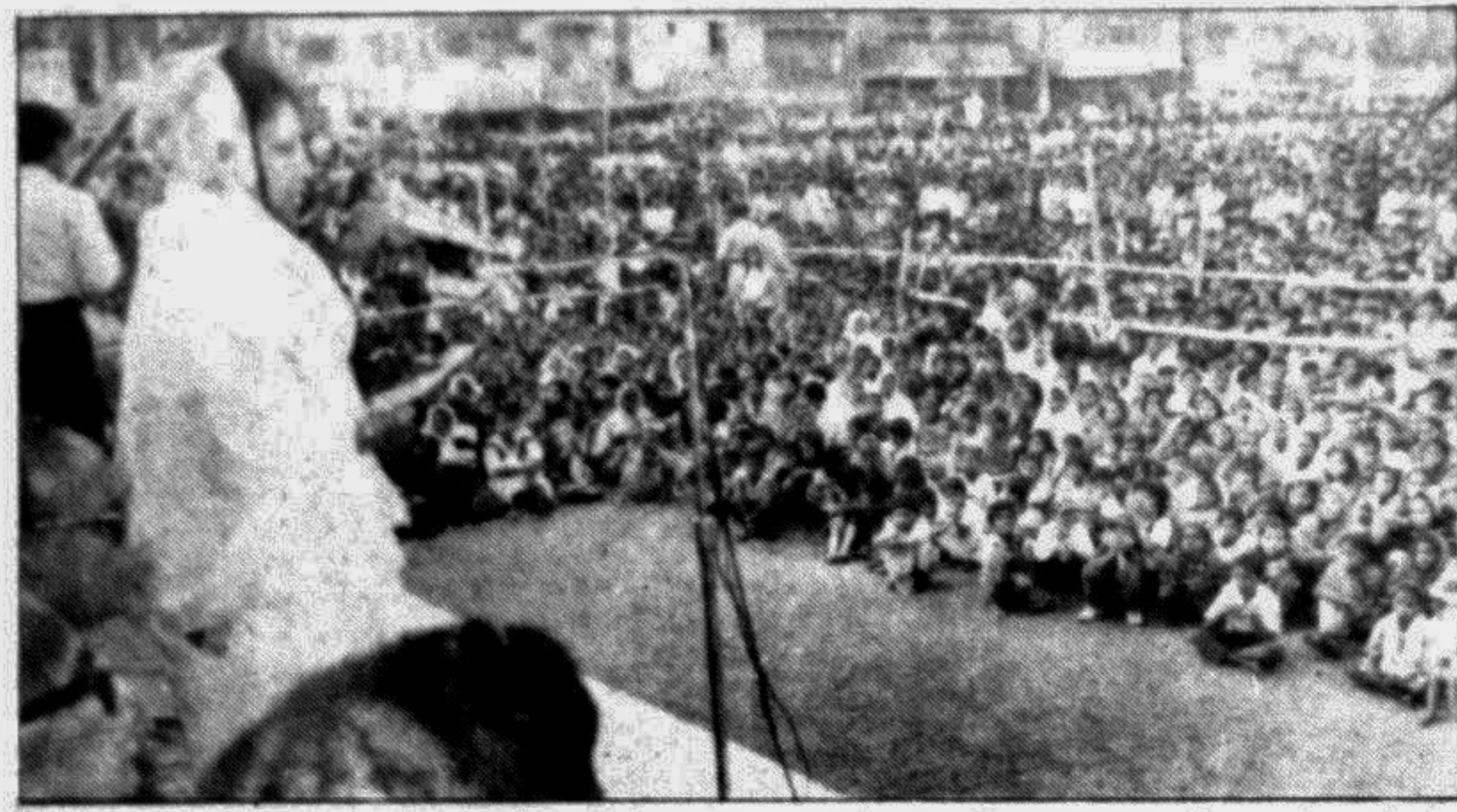
Prime Minister Begum Khaleda Zia addressing a meeting at Mirpur yesterday.