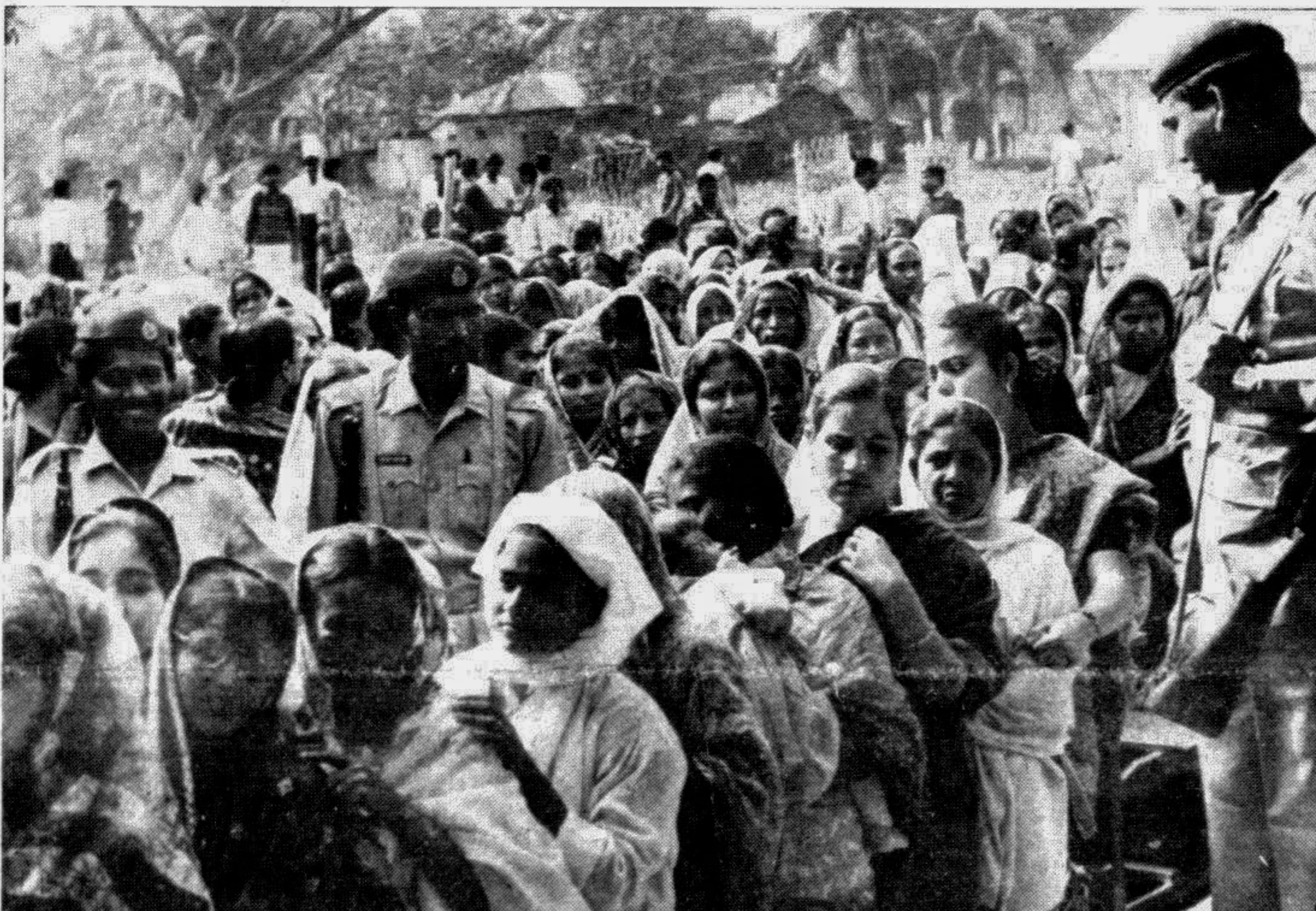
Women voters queue to cast their votes at a pourashava polling centre in Munshiganj yesterday.