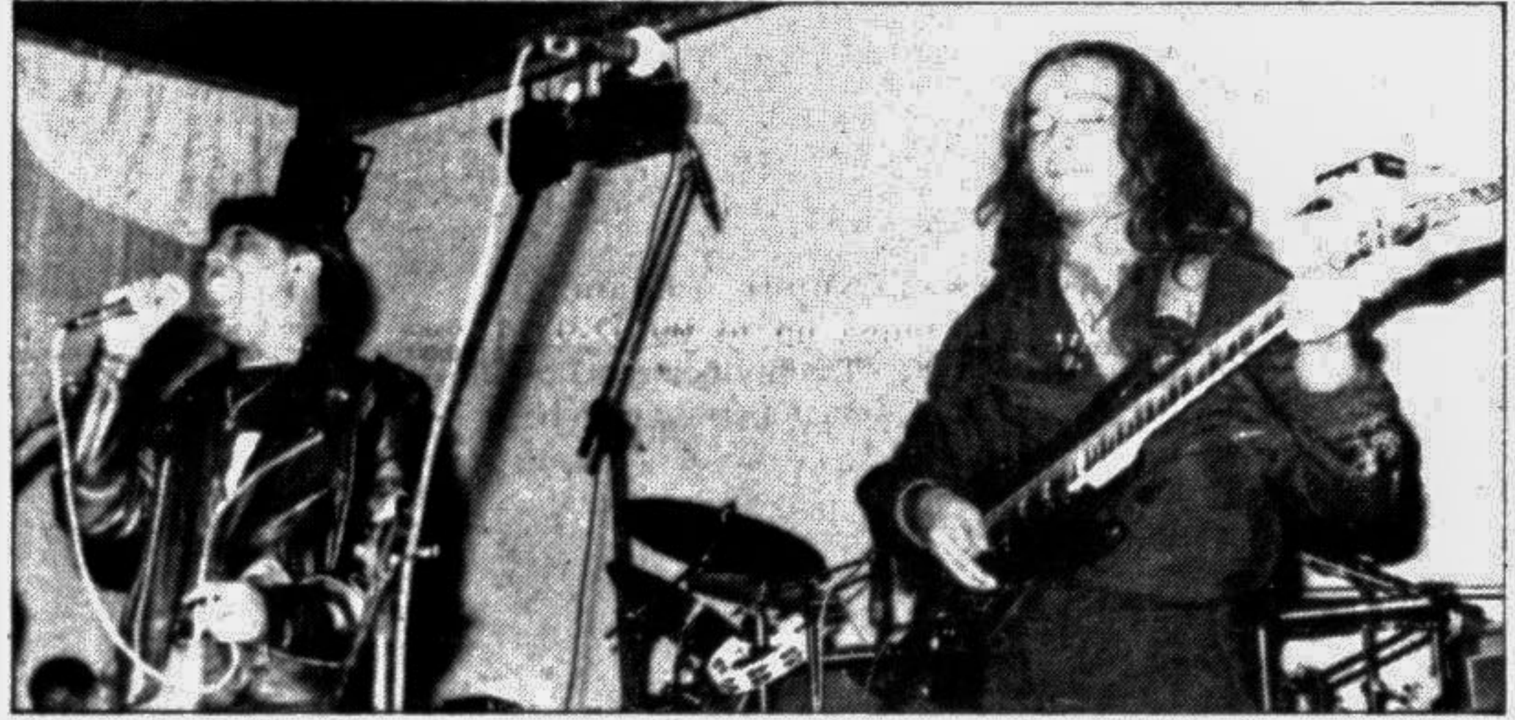
A local band, War Faze, in concert at Sheraton Hotel yesterday. Gold Leaf sponsored the programme.