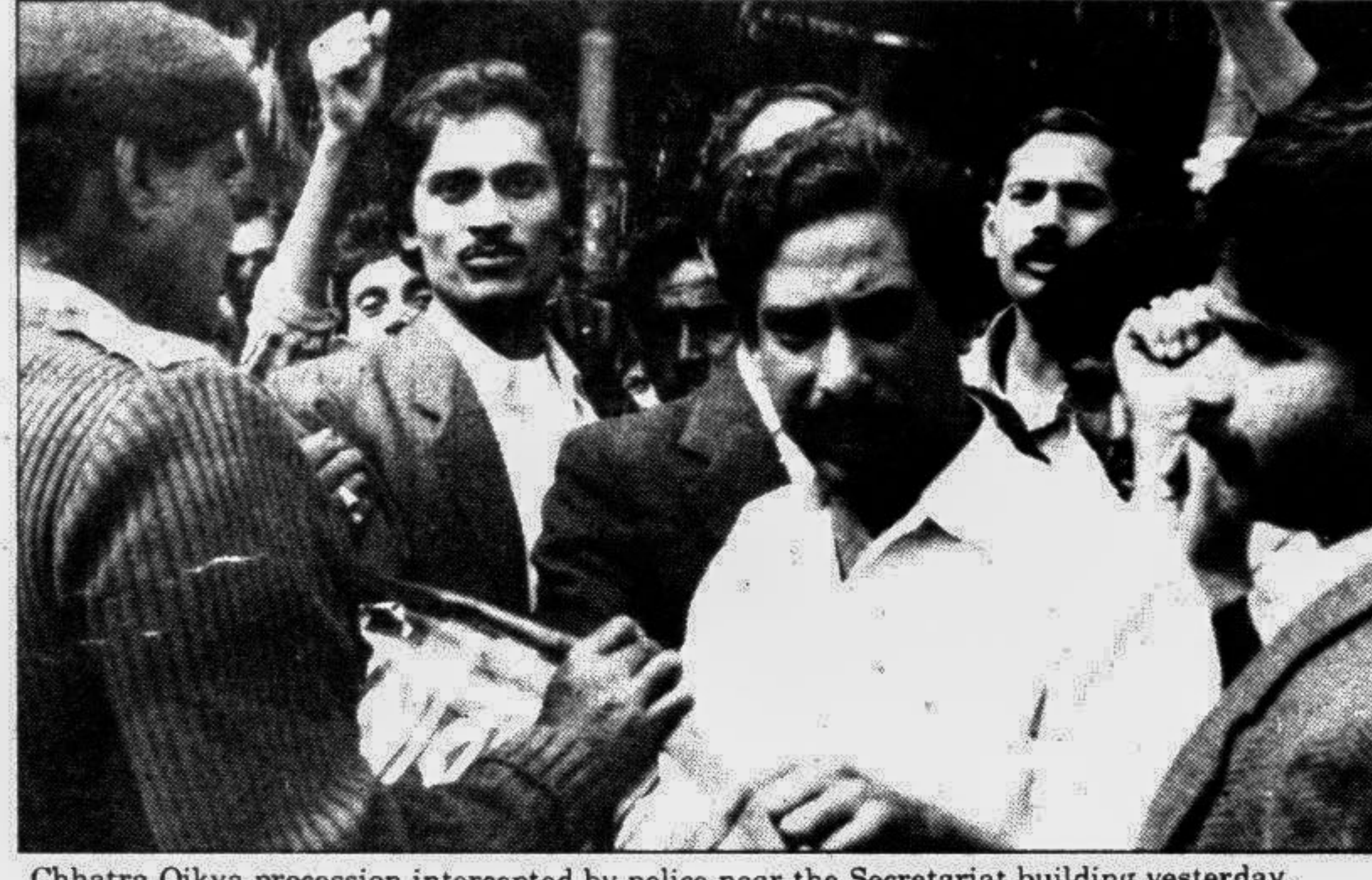
Chhatra Oikya procession intercepted by police near the Secretariat building yesterday.

Information Minister Nazmul Huda yesterday gave a clarion call to the teachers to cooperate with the government building a self-reliant Bangladesh by spreading the light of education, reports BSS.