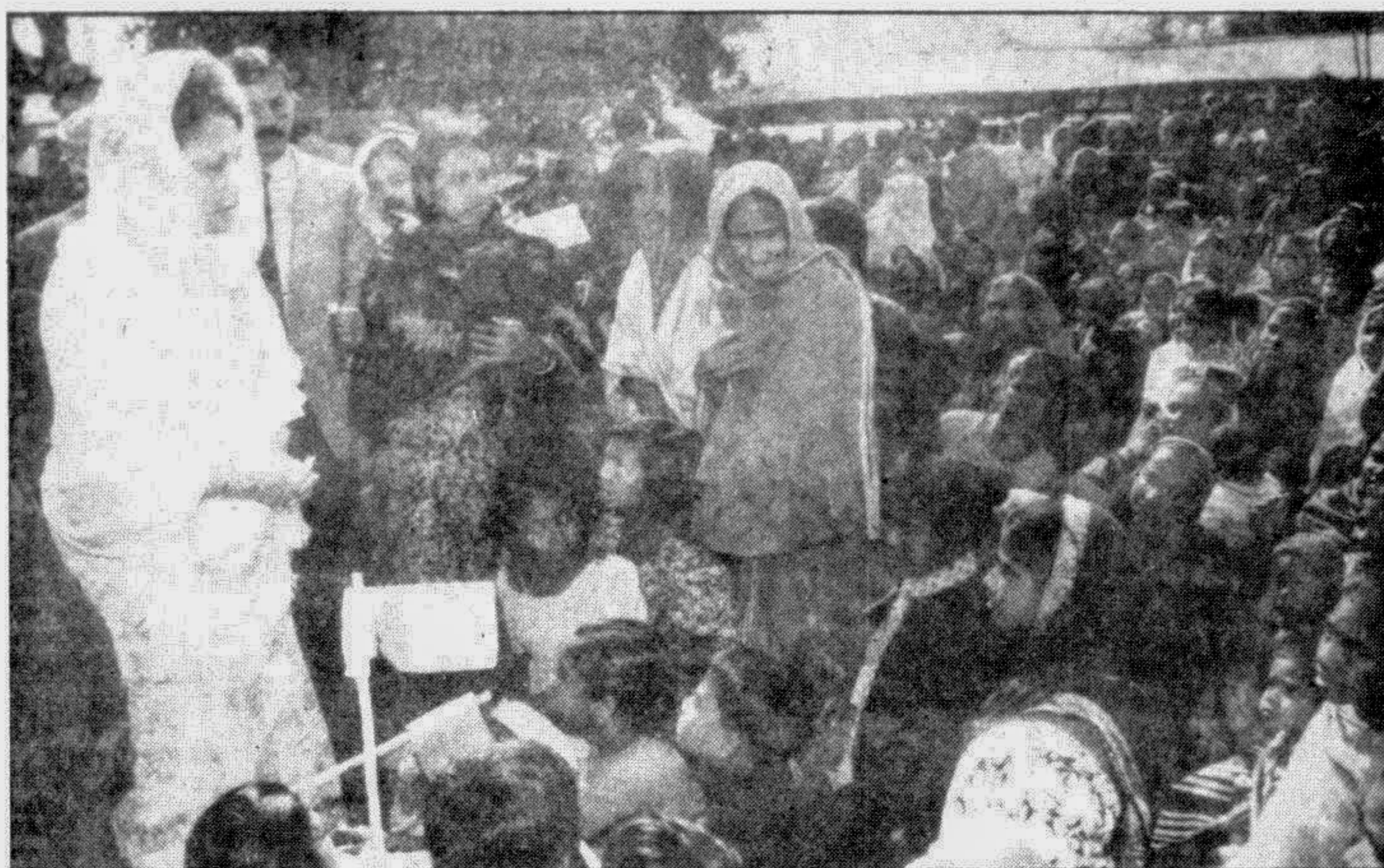
Prime Minister Khaleda Zia talking to the rural women during her visit to the different villages of Bogra Sadar and Gabtali thana of the district on January 24.

An attractive cultural programme was held at the end of the function.