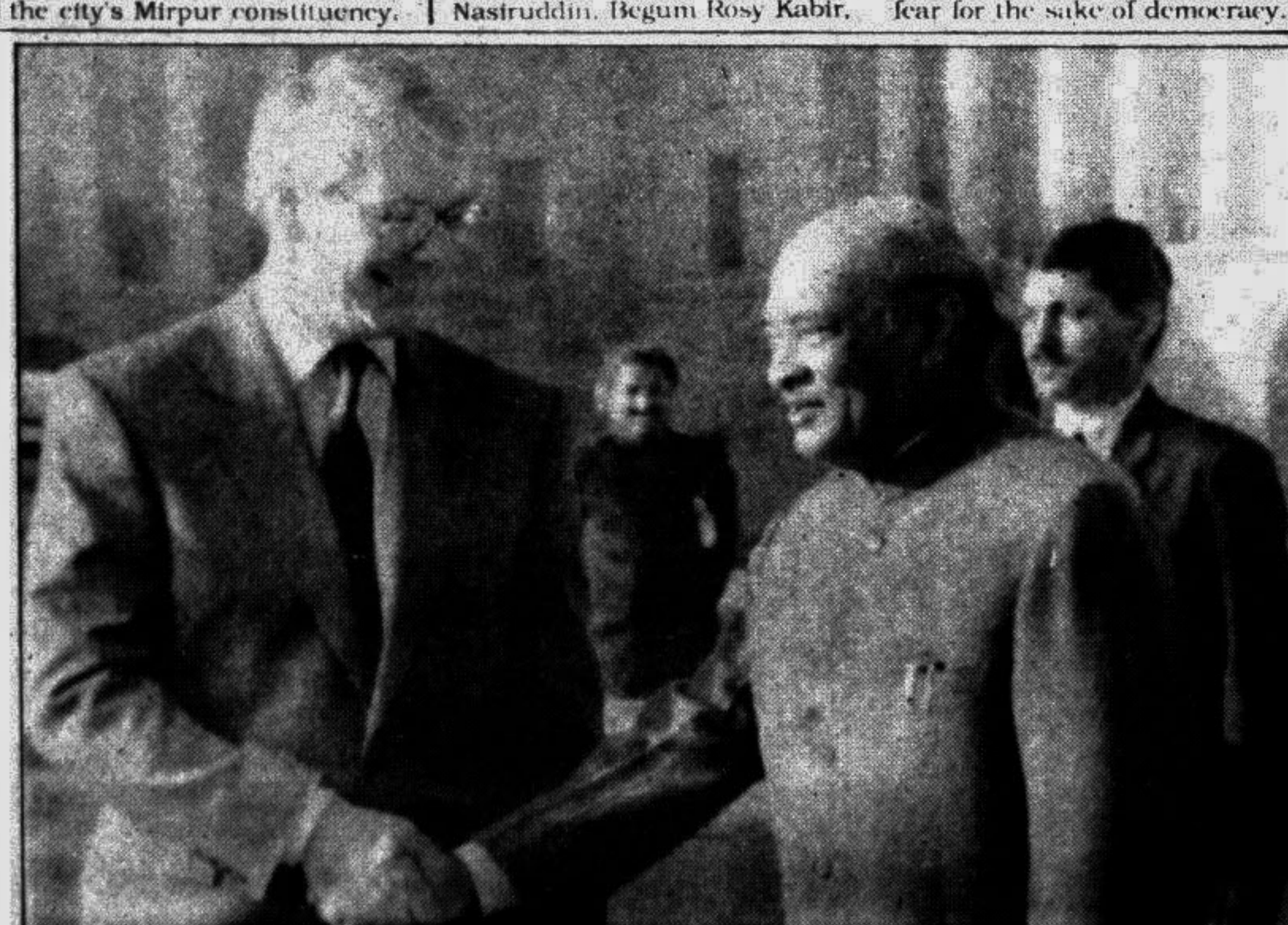
British Prime Minister John Major (left) shakes hands with his Indian counterpart P V Narasimha Rao yesterday at Rashtrapati Bhavan (Presidential Palace) in New Delhi.