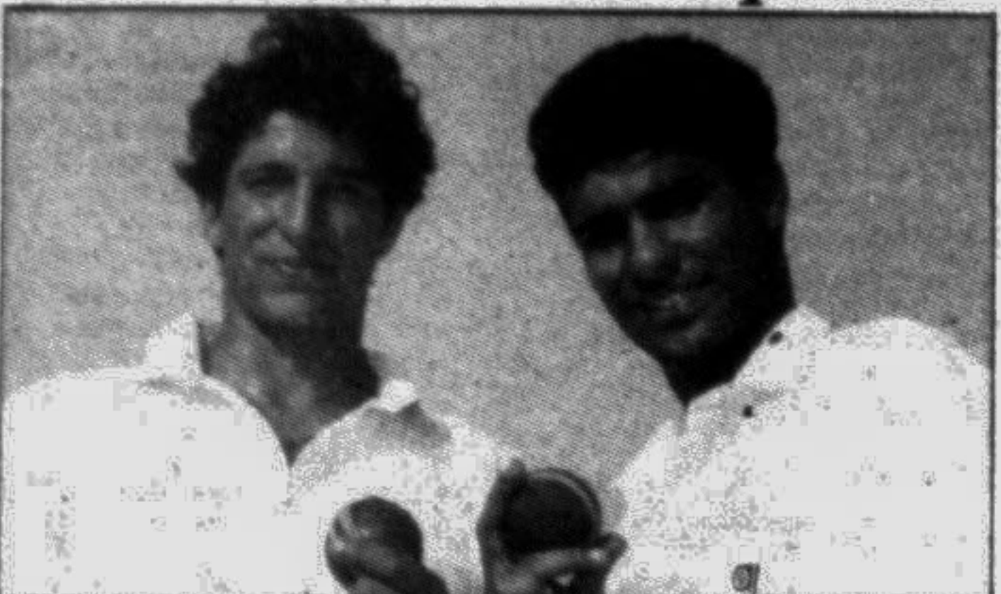
CHANGING OF THE GUARD: New Pakistan skipper Wasim Akram and his deputy Waqar Younis (R).

ISLAMABAD, Jan 25: All-rounder Wasim Akram was named captain of Pakistan's cricket team on Monday, replacing Javed Miandad, reports Reuter.