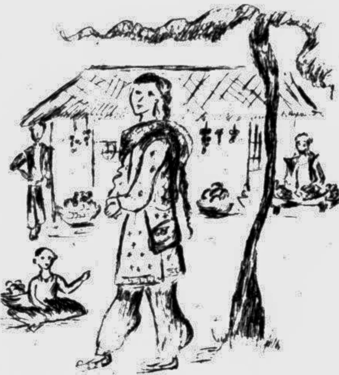
A lady going shopping

Dhaka is not London or Washington or Tokyo. A lady must apply her ingenuity, to obtain all the required items for her family and friends, for all occasions.