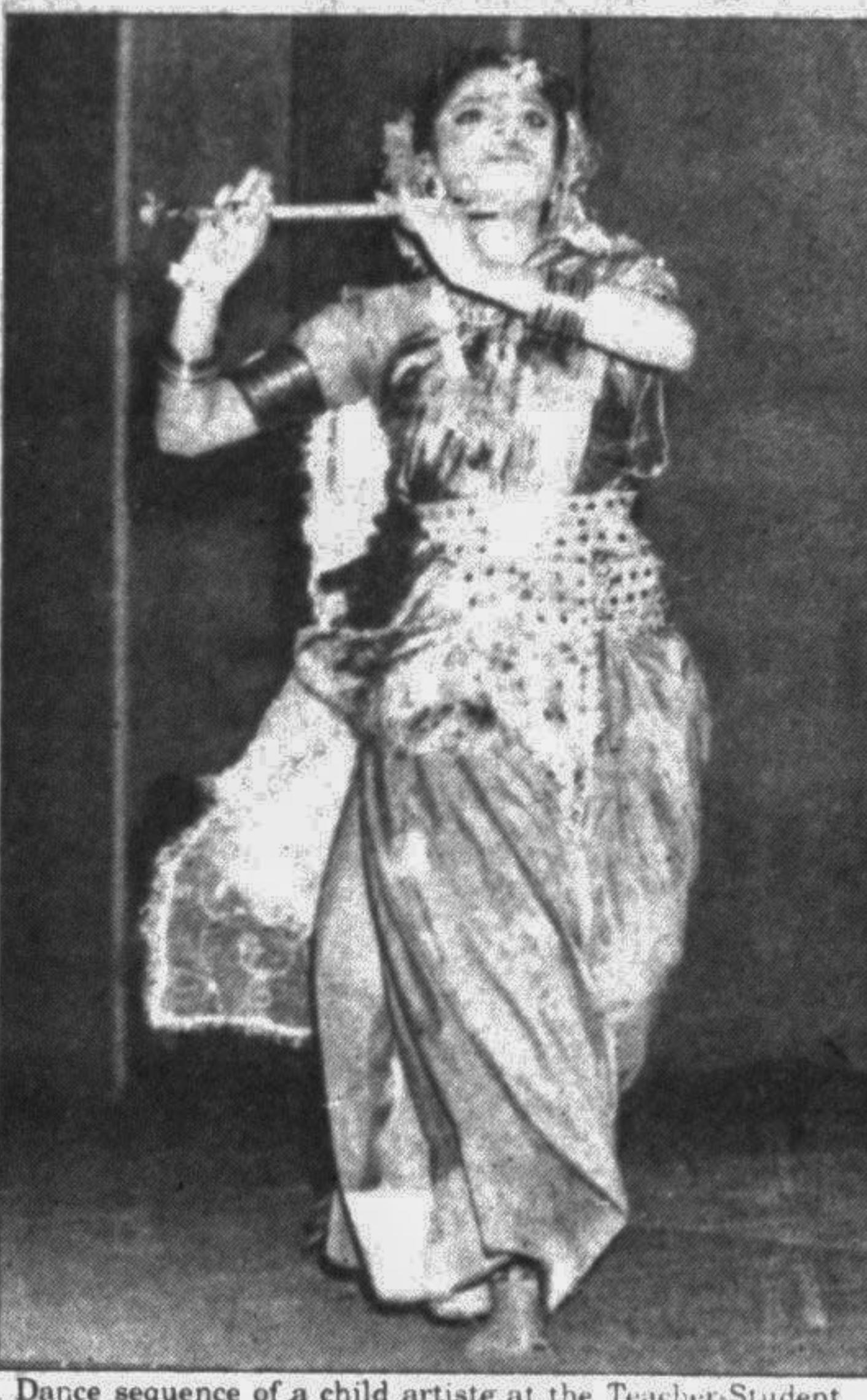
Dance sequence of a child artiste at the Teacher-Student Centre of BUET in observance of the 40th founding anniversary programme of Khelaghar yesterday.

Better system for students' evaluation demanded By Staff Correspondent Minister for Education Barrister Jamiruddin Sircar Saturday focusing on the problems of the secondary examination of the last year urged all concerned to formulate a better system of evaluating students. The minister said that a collective decision should be made regarding methods of changing the examination system, development of syllabus, texts and making the objective types of questionnaire acceptable to all. He was inaugurating a seminar on "Introduction of objective questions in the secondary examinations: Problems and solution" organised by the Dhaka Ahsania Mission in the city. The seminar was attended among others by Dhaka University Vice-Chancellor Professor Emajuddin Ahmed and State Minister for Education Principal Md Yunus Khan as special guests. The day-long seminar was presided over by Chairman of the University Grants Commission Prof M Shamsul Haq while it was addressed among others by Executive Director of the Ahsania Mission Kazi Rafikul Alam.