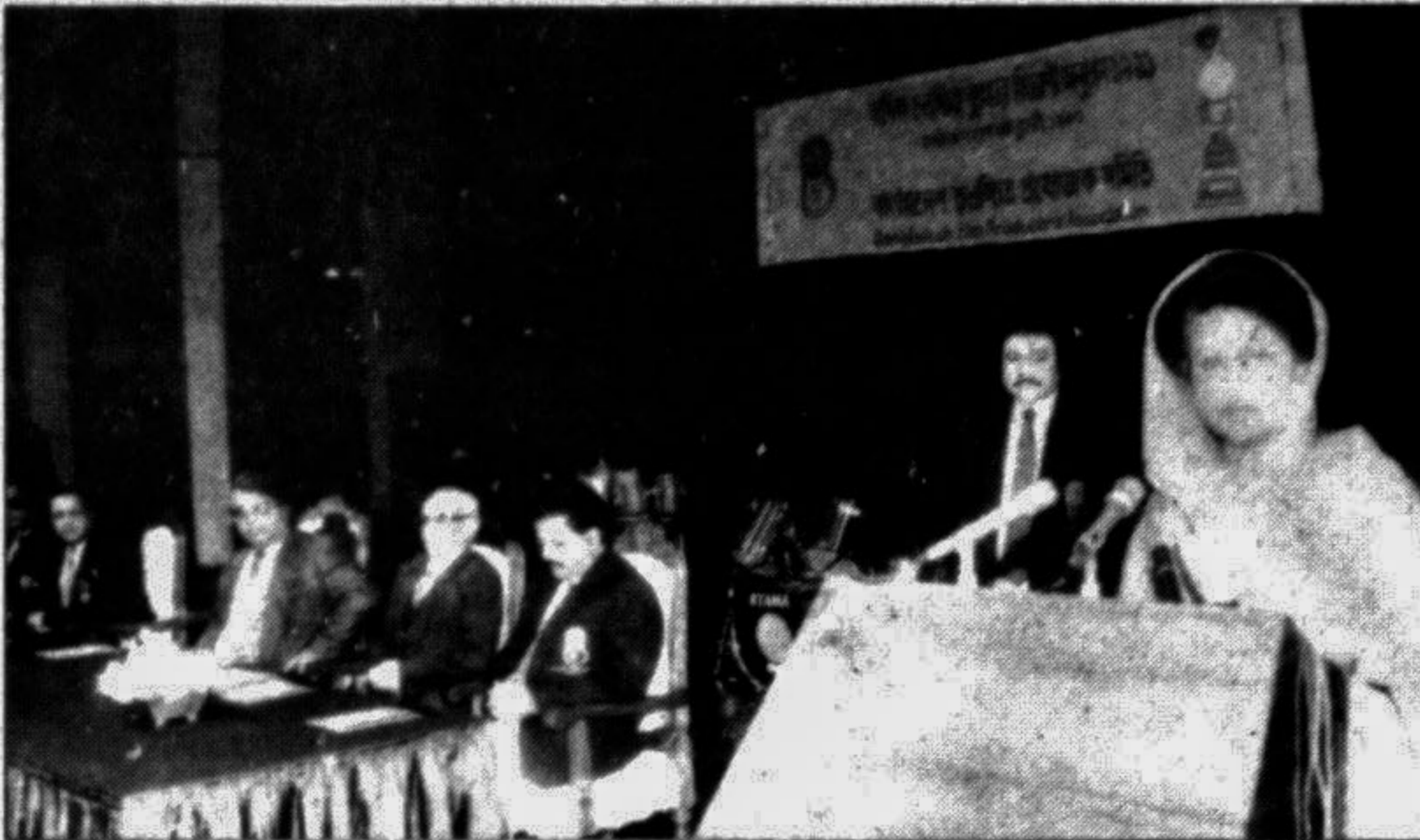
Prime Minister Begum Khaleda Zia speaking at the Bangladesh Film Award-1991 distribution ceremony held at the Osmany Memorial Hall in city yesterday.

LONDON, Jan 22 : Low blood pressure can reduce the risk of heart disease and stroke but according to a report by Swedish researchers published on Friday it can also undermine your self-confidence and sense of well being, reports Reuter.