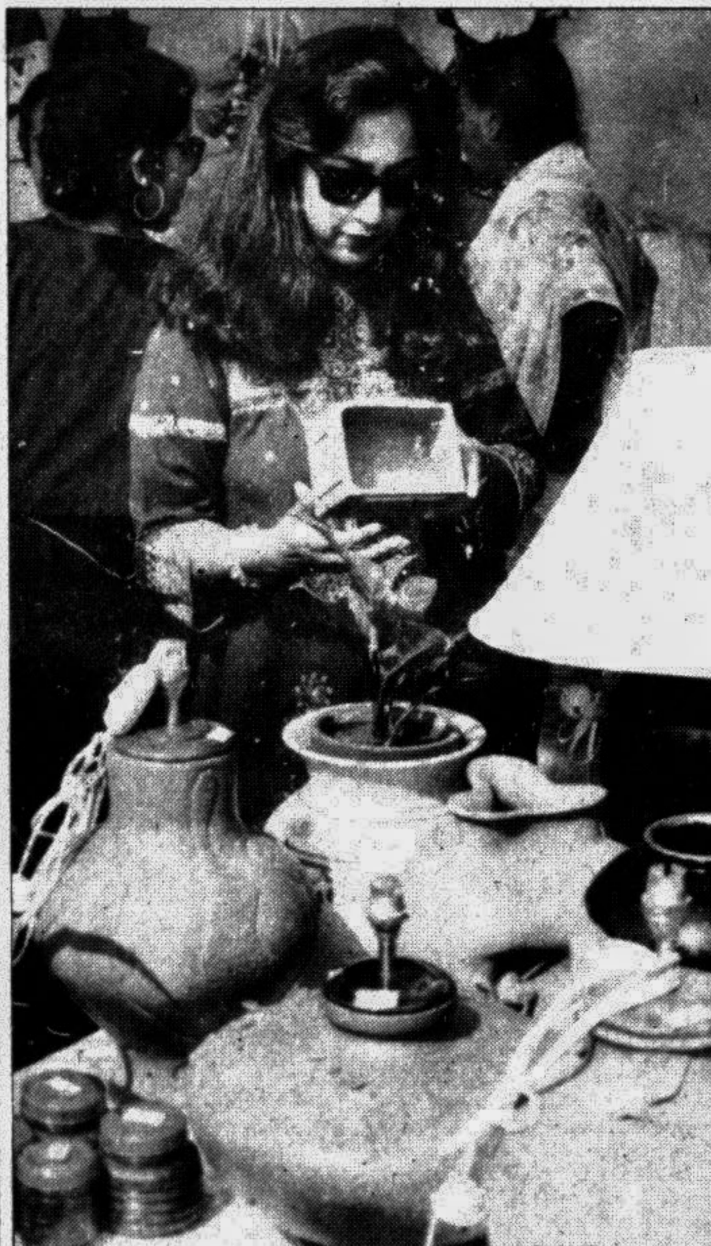
A visitor taking keen interest in earthenware at the Meena Bazar organised by the women's voluntary association (WVA) at Gulshan shishu park yesterday.

Airlines sources said according to information received at their end Vajpayee had gone to the airport.