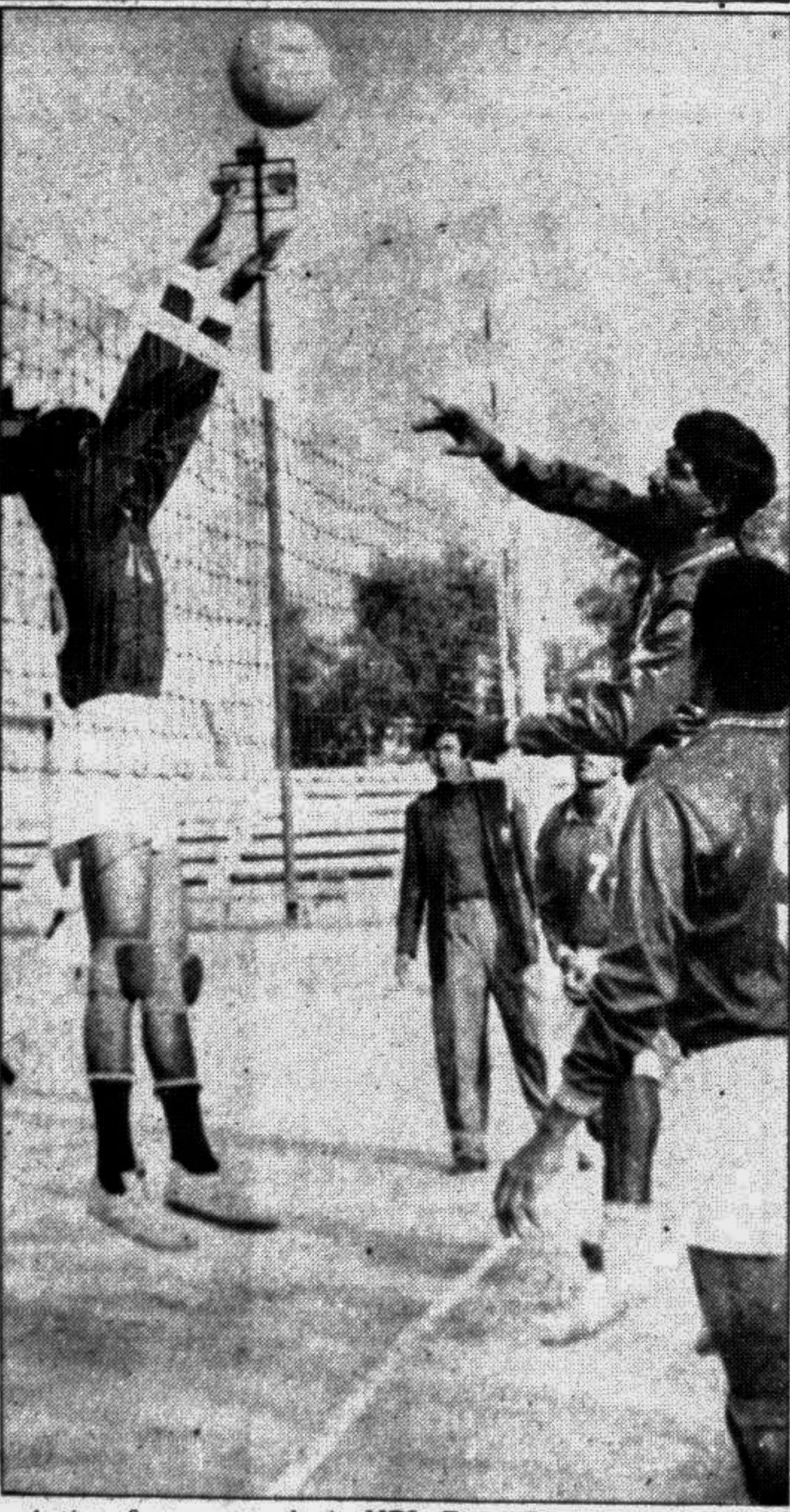
Action on yesterday's NBL First Division volleyball league engagement between Bangladesh Police and Eastern Club at the Outer Stadium volleyball court. Police won 15-10, 15-4 and 15-11.

All the managers of the quarter finalist teams have been asked to attend.