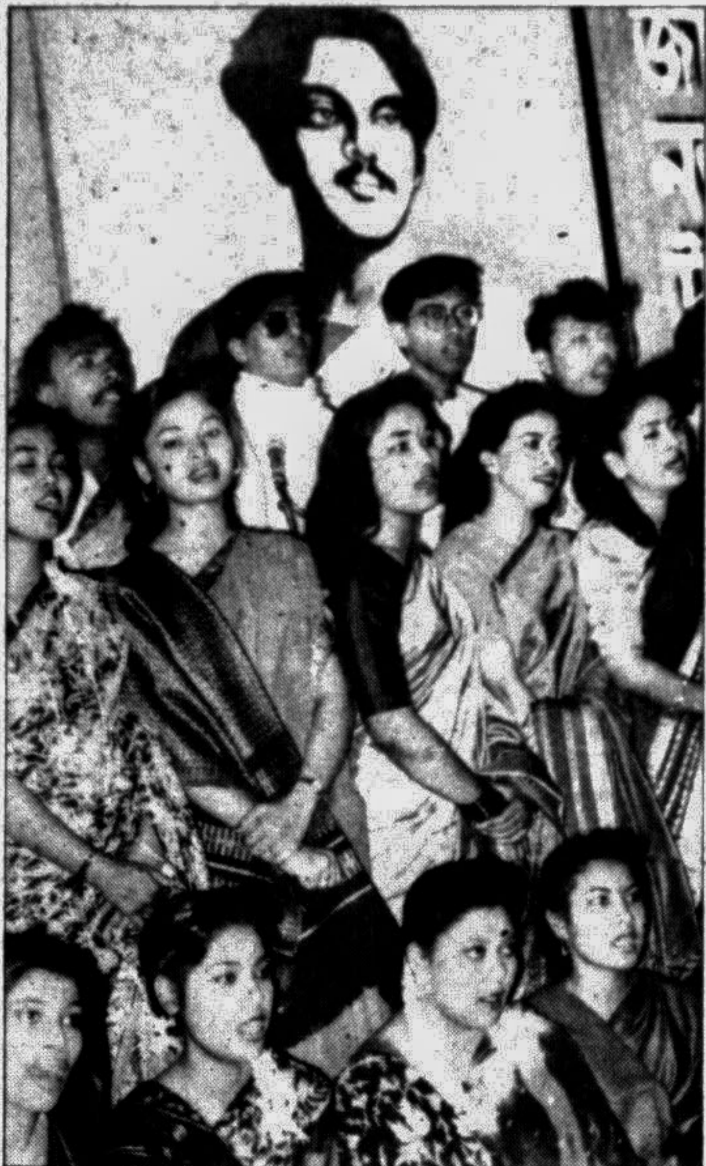
Singers of different Nazrul Sangeet academies at the opening ceremony of Nazrul Song Festival at Shilpakala Academy auditorium in city yesterday.

From Page 1 Col 8 Geneva, said a relative who answered the door at the residence. She spoke on condition of anonymity. The village was quiet on Thursday, and neighbours had tears in their eyes. One woman recalled that she used to meet Hepburn as they both walked their dogs in the village streets. A small, black-bordered death announcement posted on the village notice board said her funeral service would be held in the village church on Sunday, followed immediately by burial in the local cemetery. Hepburn epitomized high-fashion elegance and inspired many designers with her beauty, but spent her last years traveling the globe in jeans and T-shirts working for needy children as a goodwill UN ambassador. As a child, she herself received help from the agency after surviving the last winter of World War II in Holland on a diet of mostly turnips.