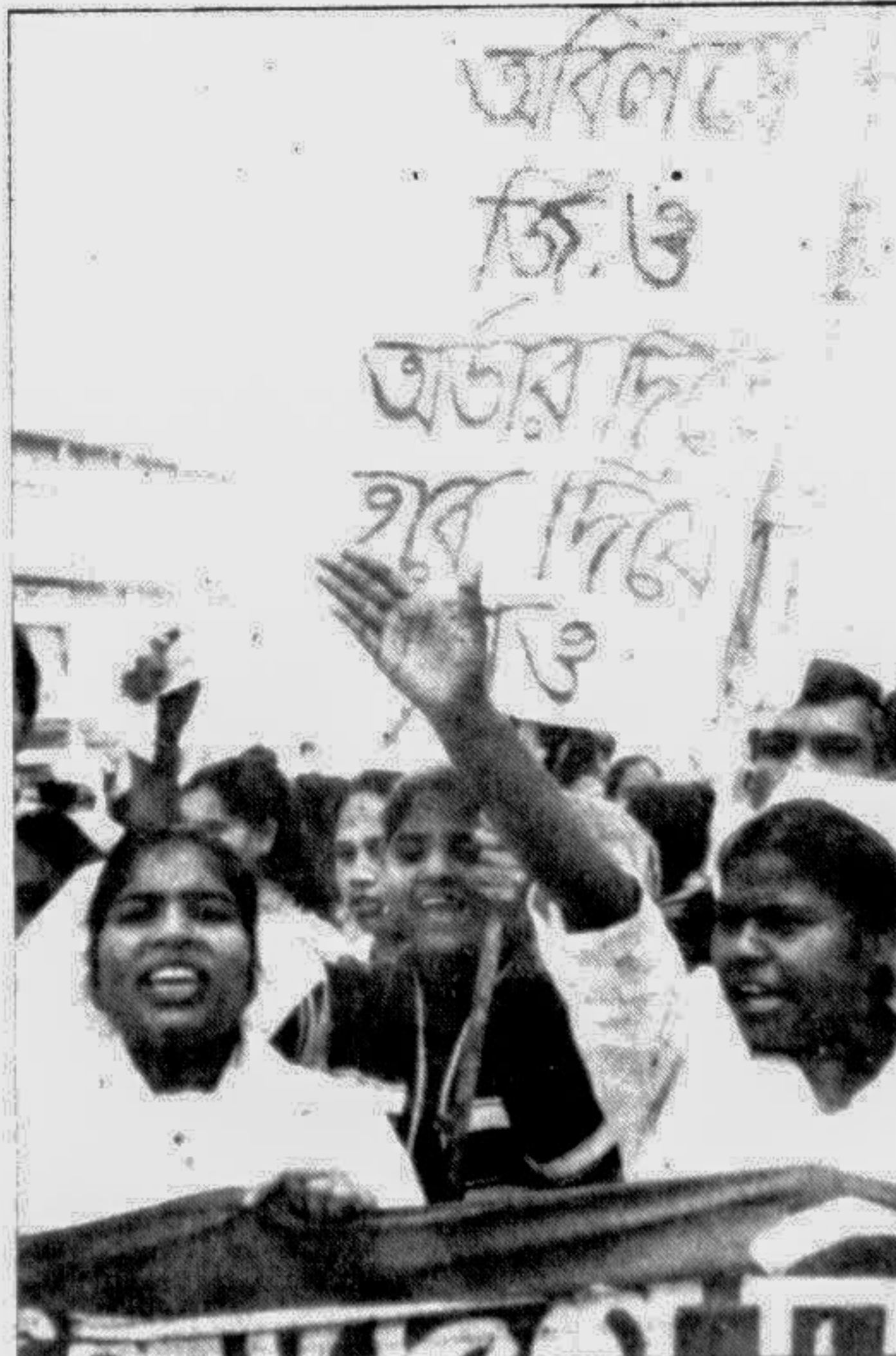
Dhaka Medical College Hospital Nurses' Association brought out a procession in city yesterday to press for their demands.