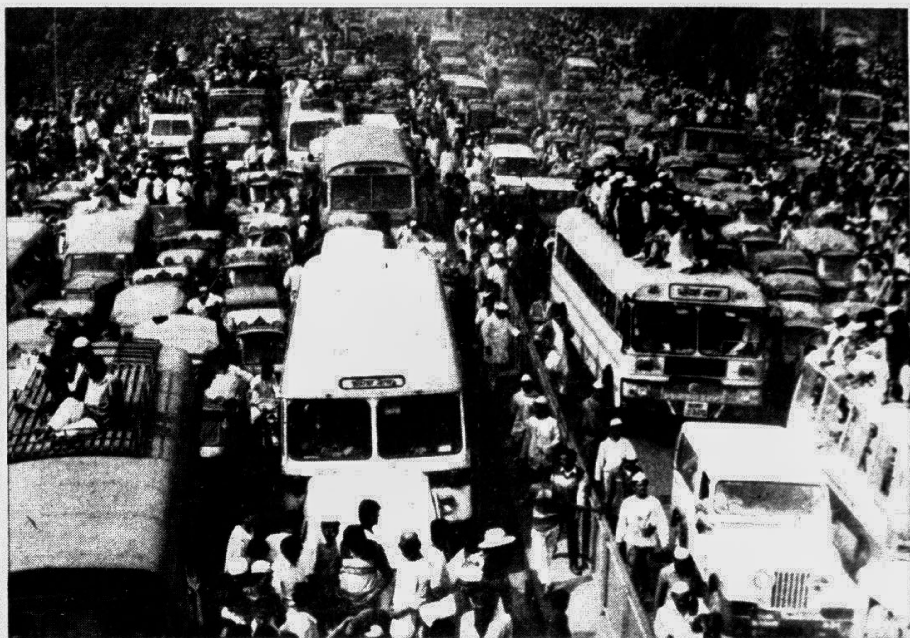
Traffic jam continued for about three hours at the Airport Road after the Akheri Monajaat at Tongi yesterday.

Local police put out the fire with the help of fire extinguisher from a launch of the ghat.