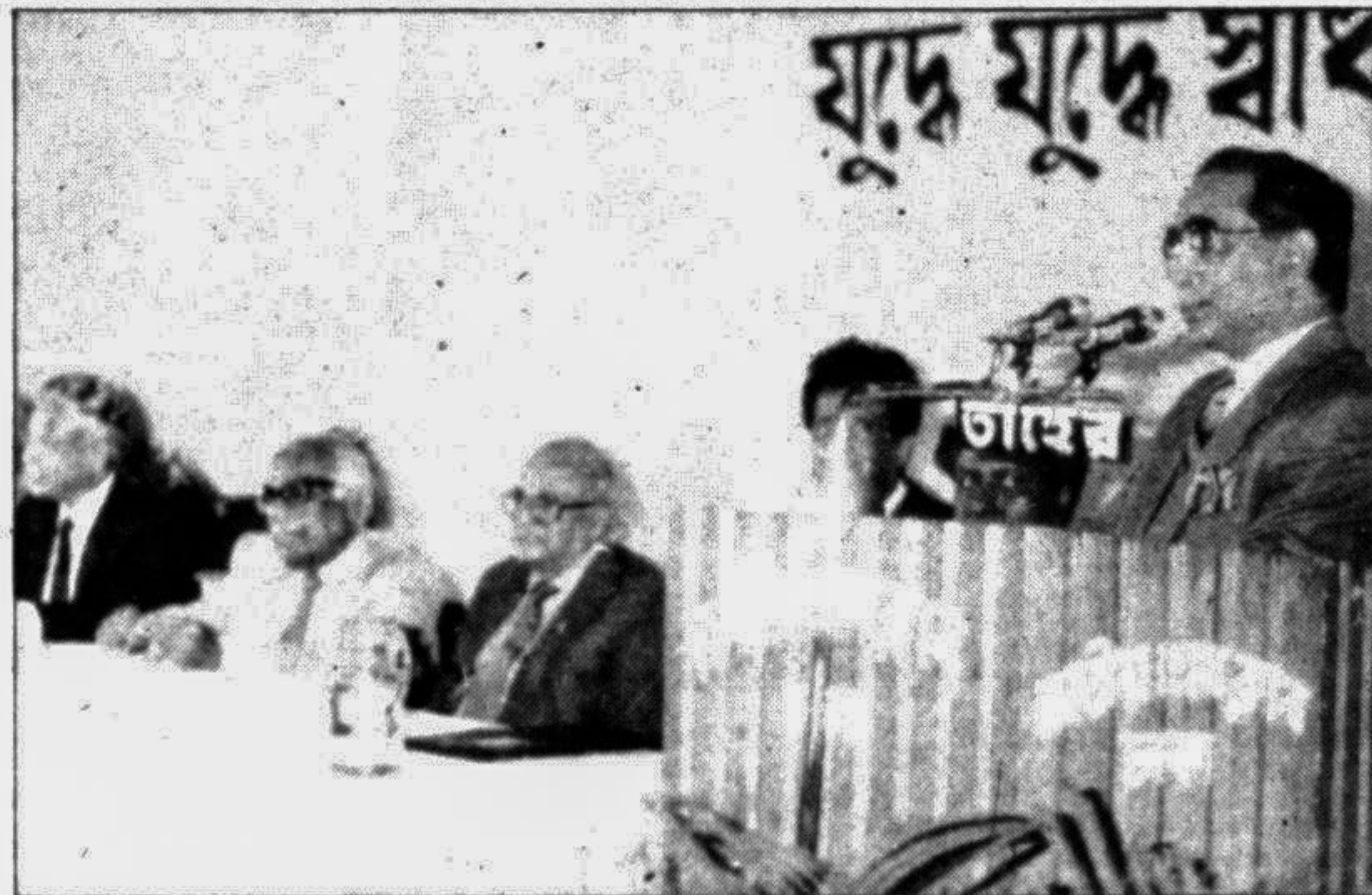
H T Imam, Cabinet Secretary of the Government of Bangladesh in exile addressing the publication ceremony of "Judhey Judhey Sadhinata" at the Jatiya Press Club auditorium yesterday.