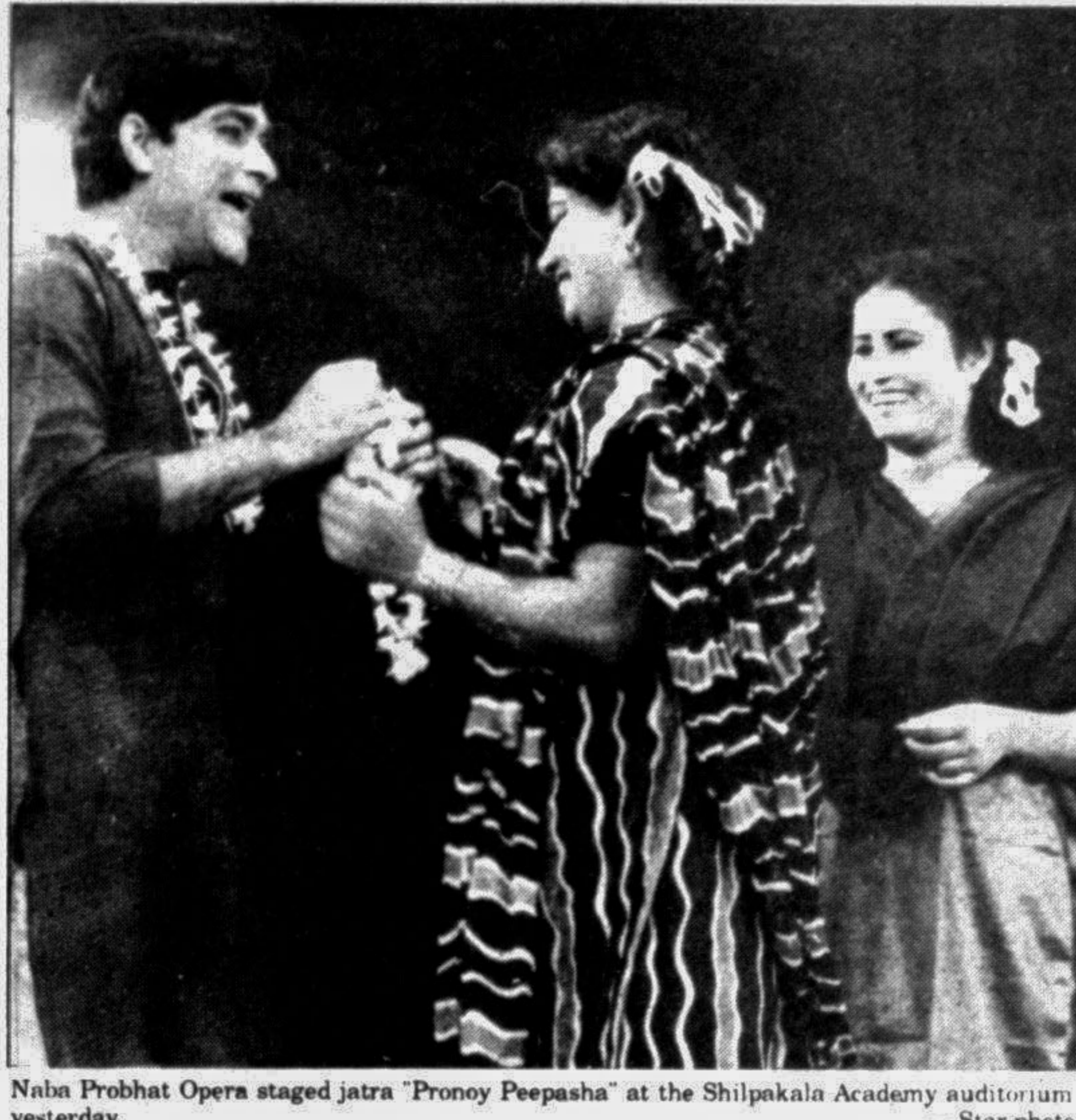
Naba Prokhat Opera staged jatra 'Pronoy Peepasha' at the Shilpakala Academy auditorium yesterday.