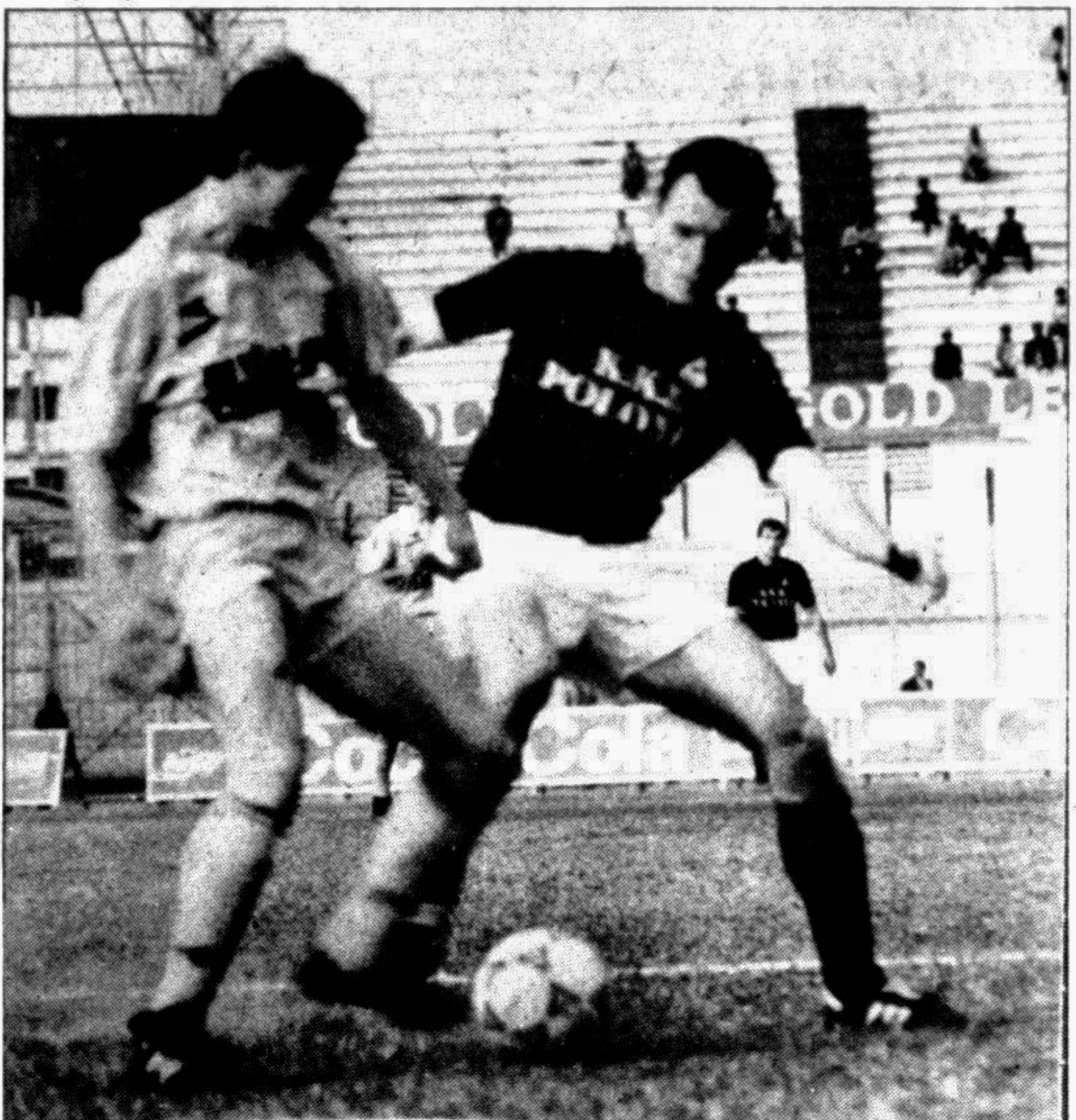
A scene from yesterday's final of the 7th President Gold Cup tournament between F.C Ploesti of Romania and Polonia Warszawa of Poland. Romanians won the match 1-0 to lift the trophy.