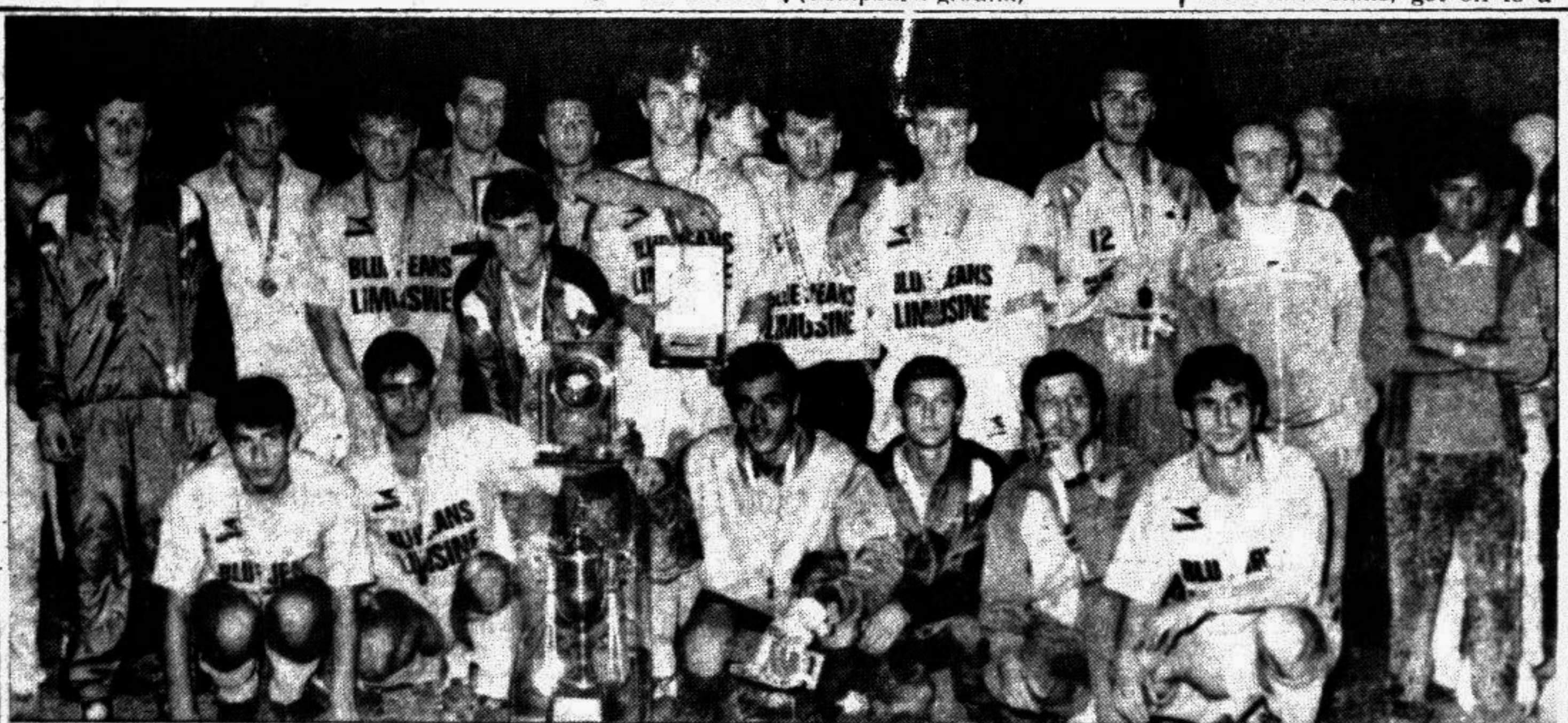
Champions F.C Ploesti of Romania with the President Gold Cup. Ploesti beat Polonia Warszawa 1-0 in the final at the Dhaka Stadium yesterday.

The Australian Open, the first Grand Slam event of 1993, opens Monday at the National Tennis Centre.