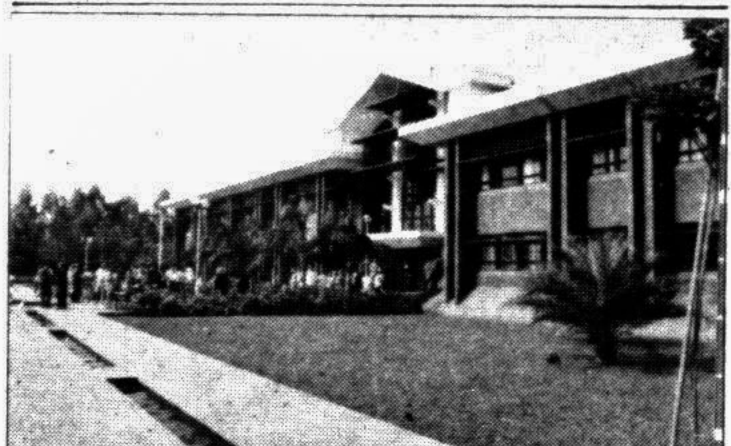
The newly built British High Commission building at Baridhara. It was inaugurated by British Home Minister Kenneth Clarke recently.