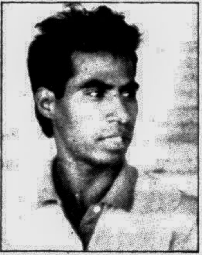
MONI ... 52 & 6 for 53

wicket caught Rupam for 40. Mukul's lucky knock with two dropped catches had a 89 ball span and studded with two fours.