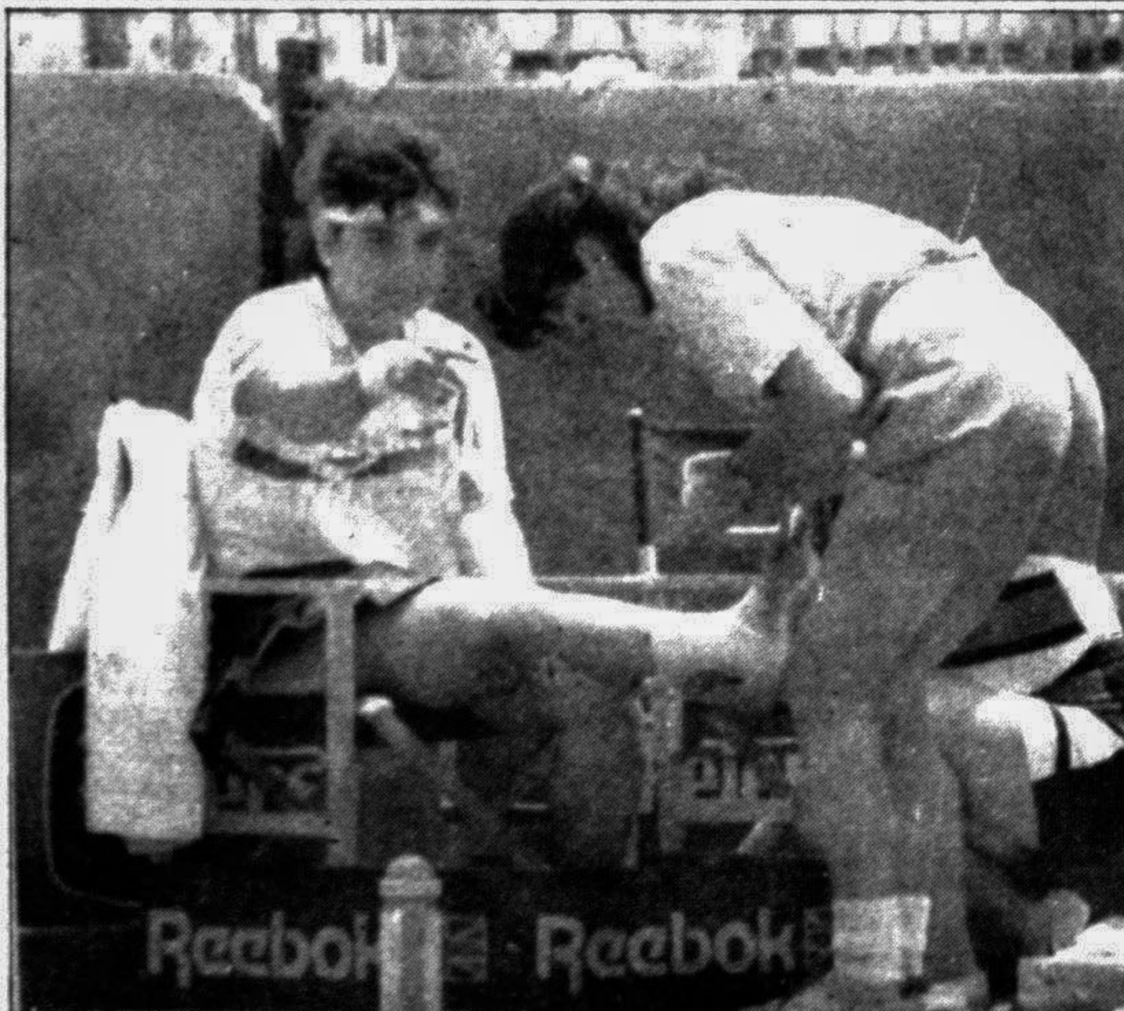
Spain's Arantxa Sanchez Vicario has her ankle taped after a fall in the first round match against Georgia's Leila Meskhi in the New South Wales Open in Sydney on Jan 12. Sanchez Vicario still defeated Meskhi 4-6, 6-4, 6-0.

"It always feels great when I start off well here."