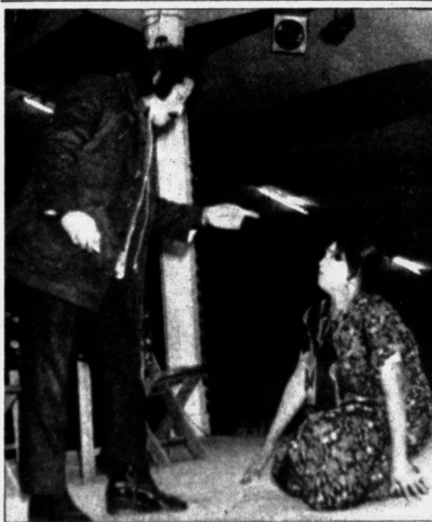
Basanti Mukta Mancha Natya Sangstha staged 'Charitraheen' a jatra at the Shilpakala Academy auditorium yesterday.

He was speaking at the fortnight review meeting of the senior police officers at the police headquarters here.