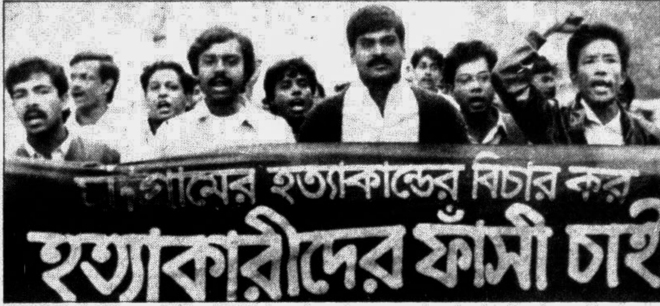
Bangladesh Chhatra Union (BCU) brought out a procession in the city demanding punishment to the persons involved in the Halishahar incident yesterday.