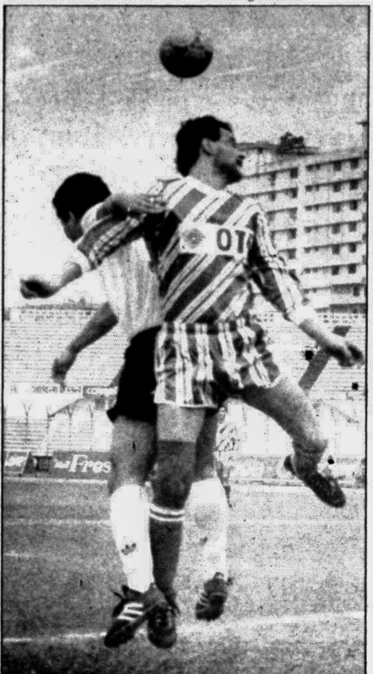
An aerial tussle between Tatra Presov (of former Czechoslovakia) and Housing Bank (South Korea) players in one of yesterday's two President Gold Cup Group B matches at the Dhaka Stadium. Housing Bank won 4-1 to earn a place in the last four.