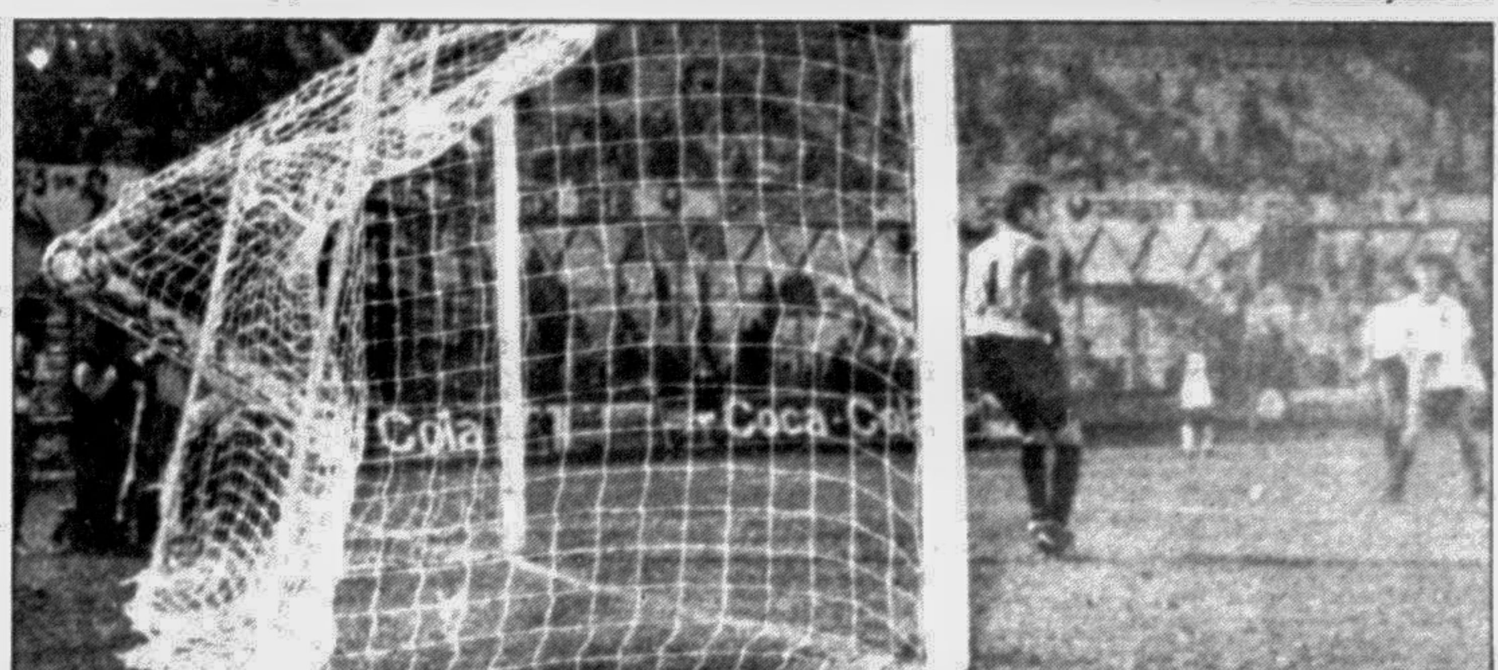
Nakib of Bangladesh Greens (not in picture) rifles in a powerful shot into the Ploesti net to reduce the margin to 1-3. The Greens lost their last group match 1-4 at the Dhaka Stadium yesterday.