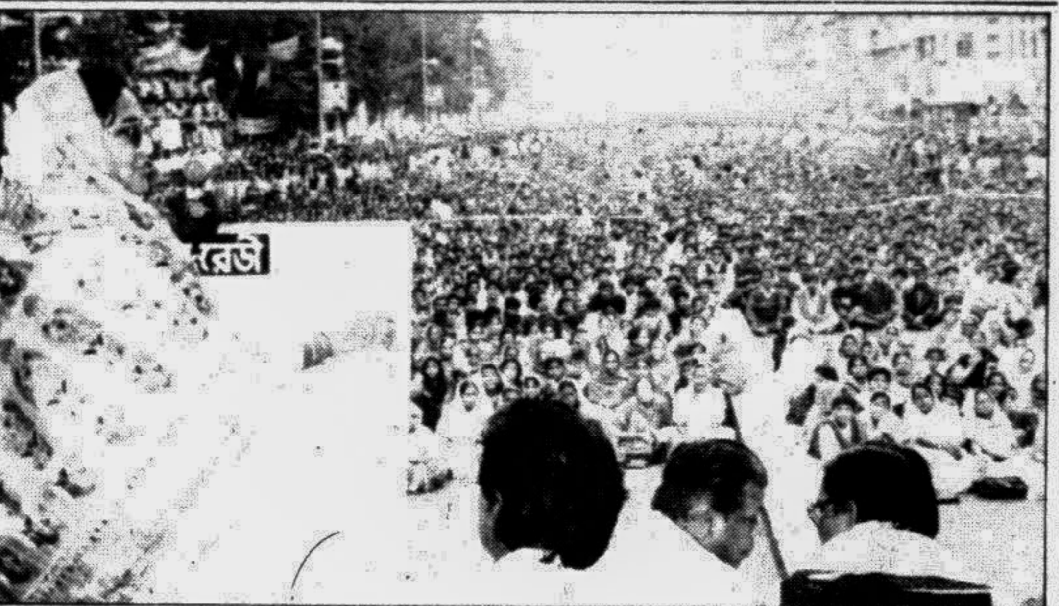
Sheikh Hasina addressing a public meeting at Bangabandhu Avenue in city yesterday marking the homecoming day of Sheikh Mujibur Rahman on January 10, 1972.