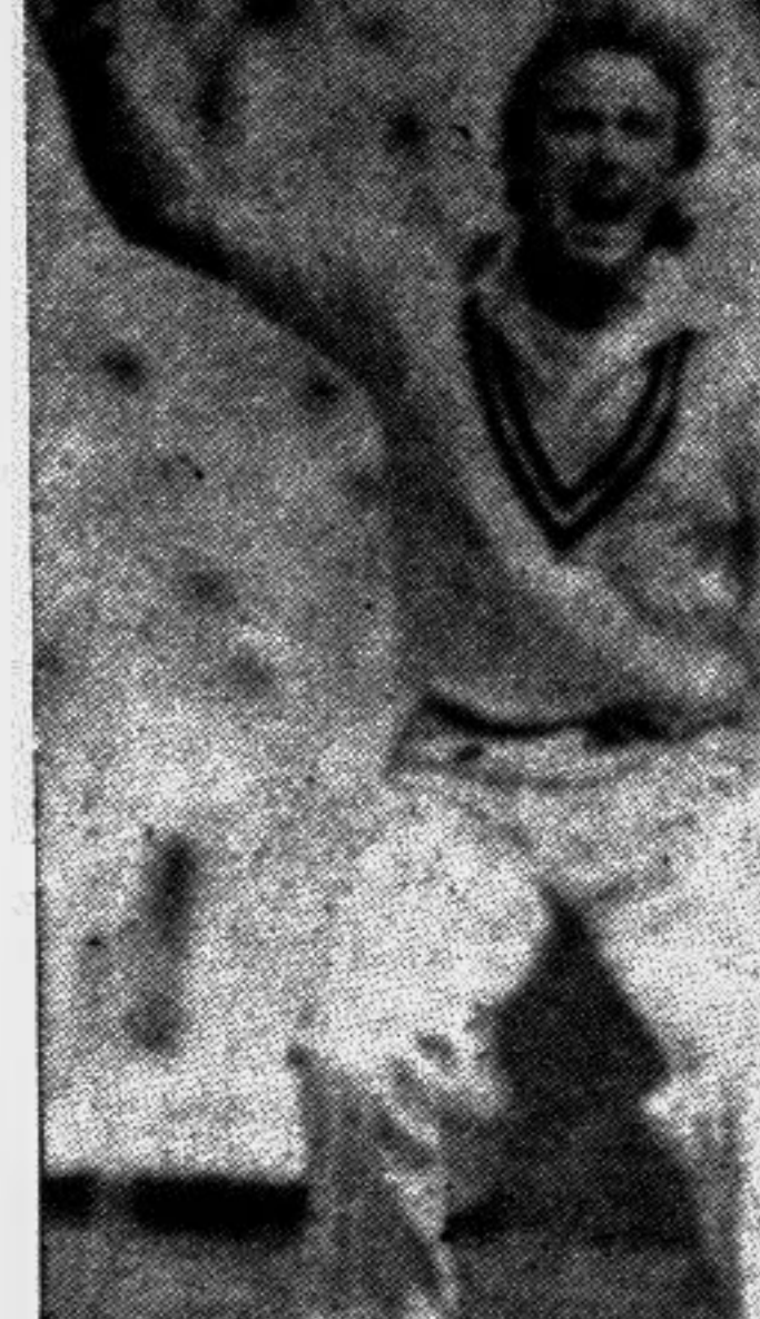
ALLAN DONALD spot in the bowlers' rankings, which are still headed by Pakistan paceman Waqar Younis.

He leaps 32 places after the series with India into 10th